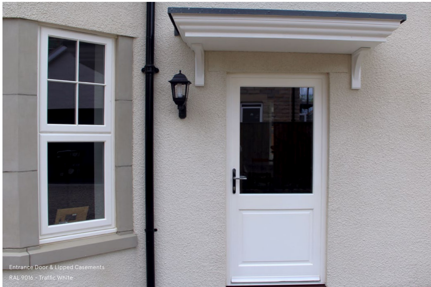
Entrance Door & Lipped Casements RAL 9016 - Traffic White