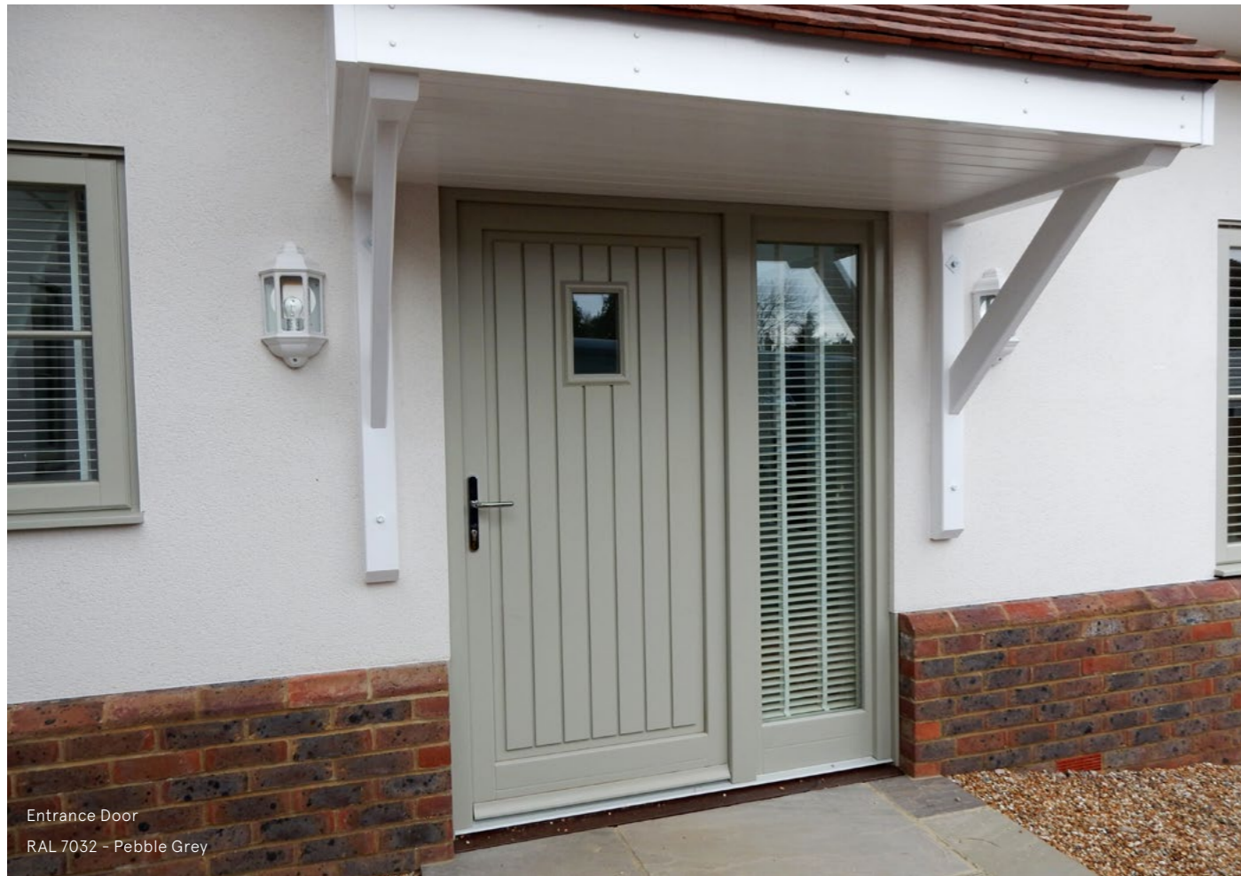
Entrance Door RAL 7032 - Pebble Grey