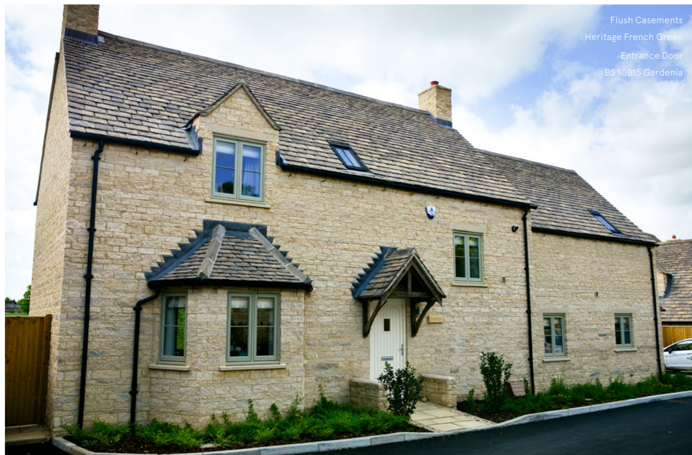
Flush Casements Heritage French Green Entrance Door BS 10B15 Gardenia