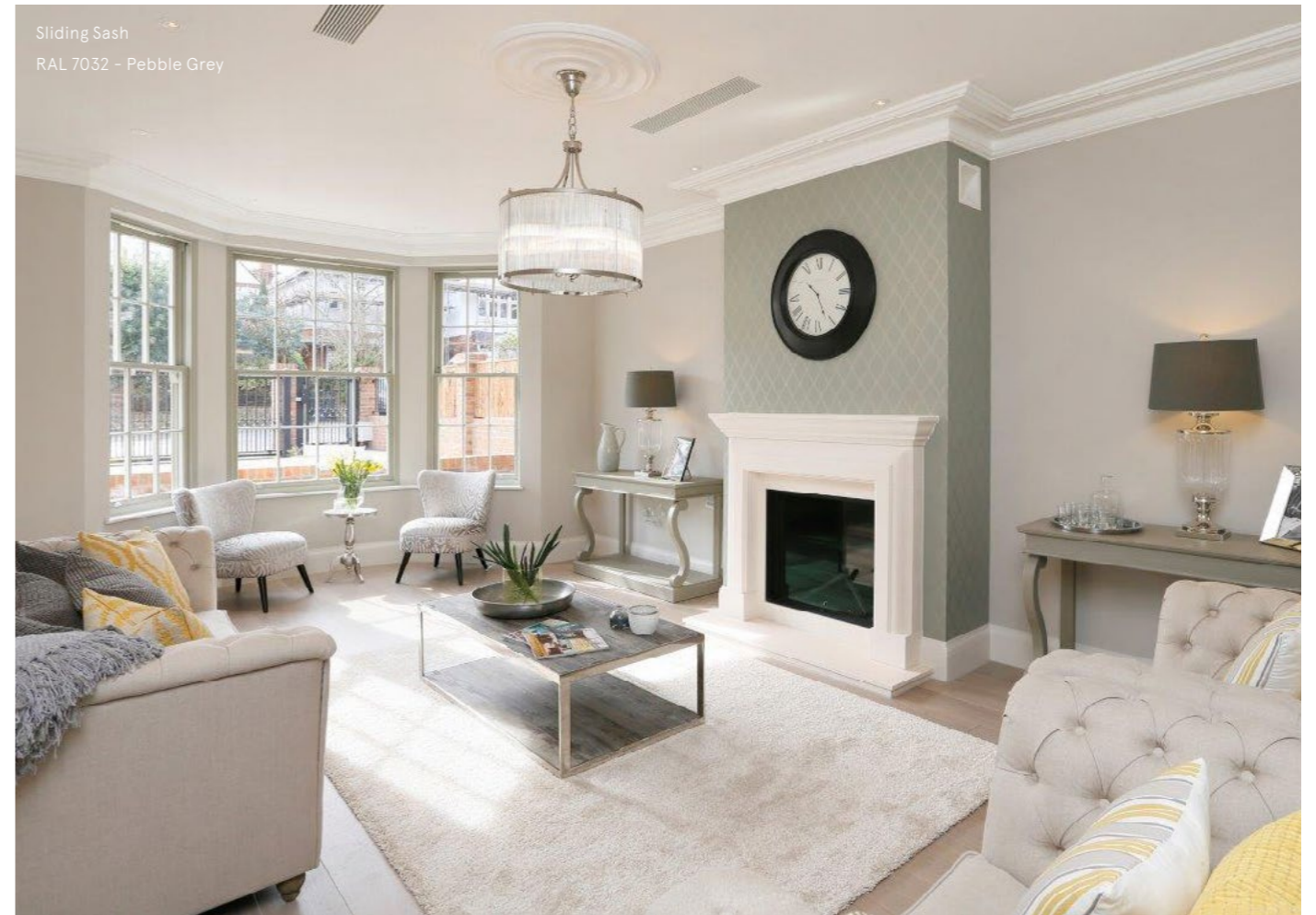
Sliding Sash RAL 7032 - Pebble Grey