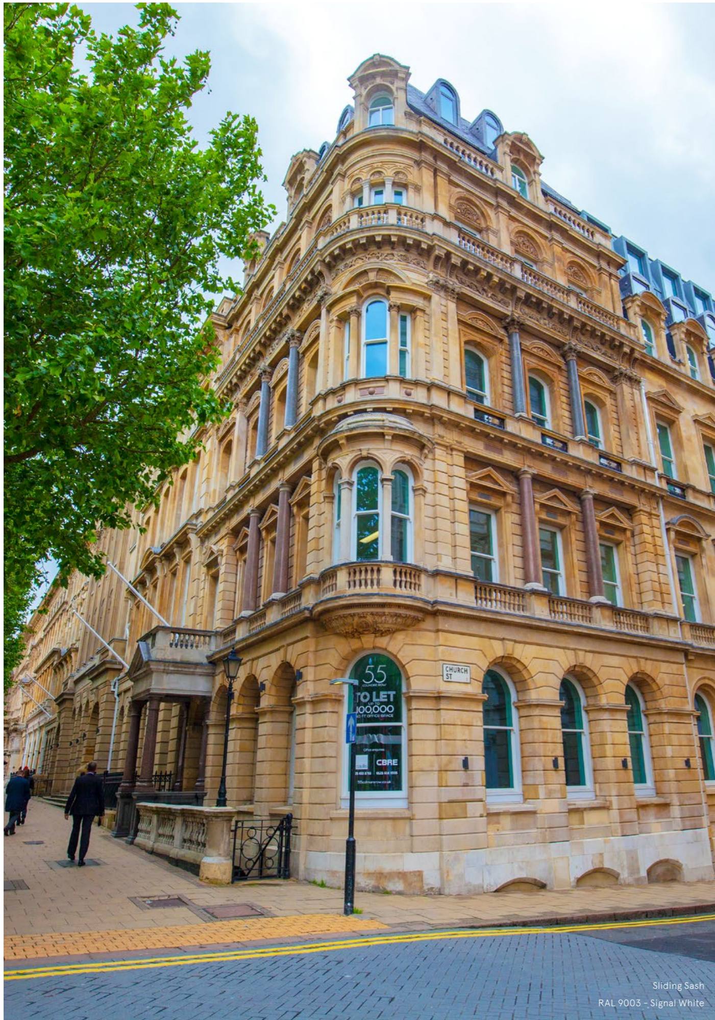
Sliding Sash RAL 9003 - Signal White