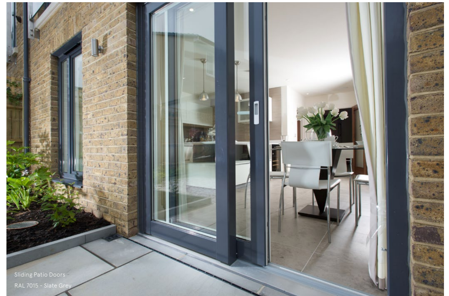
Sliding Patio Doors RAL 7015 - Slate Grey