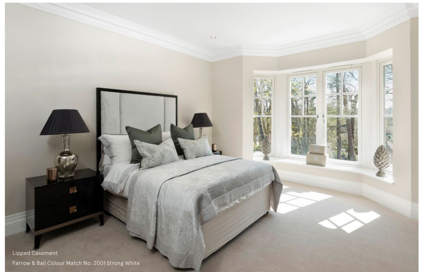
Lipped Casement Farrow & Ball Colour Match No. 2001 Strong White