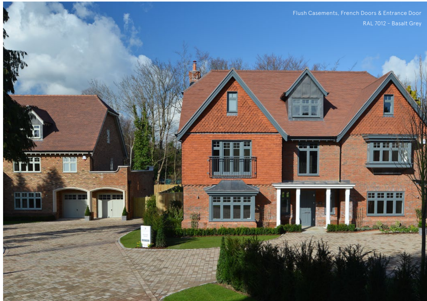
Flush Casements, French Doors & Entrance Door RAL 7012 - Basalt Grey