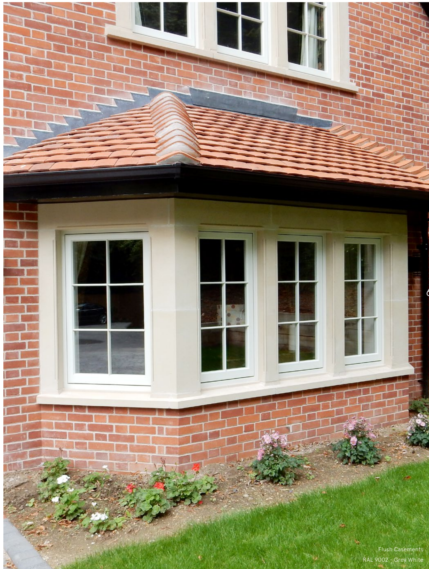
Flush Casements RAL 9002 - Grey White