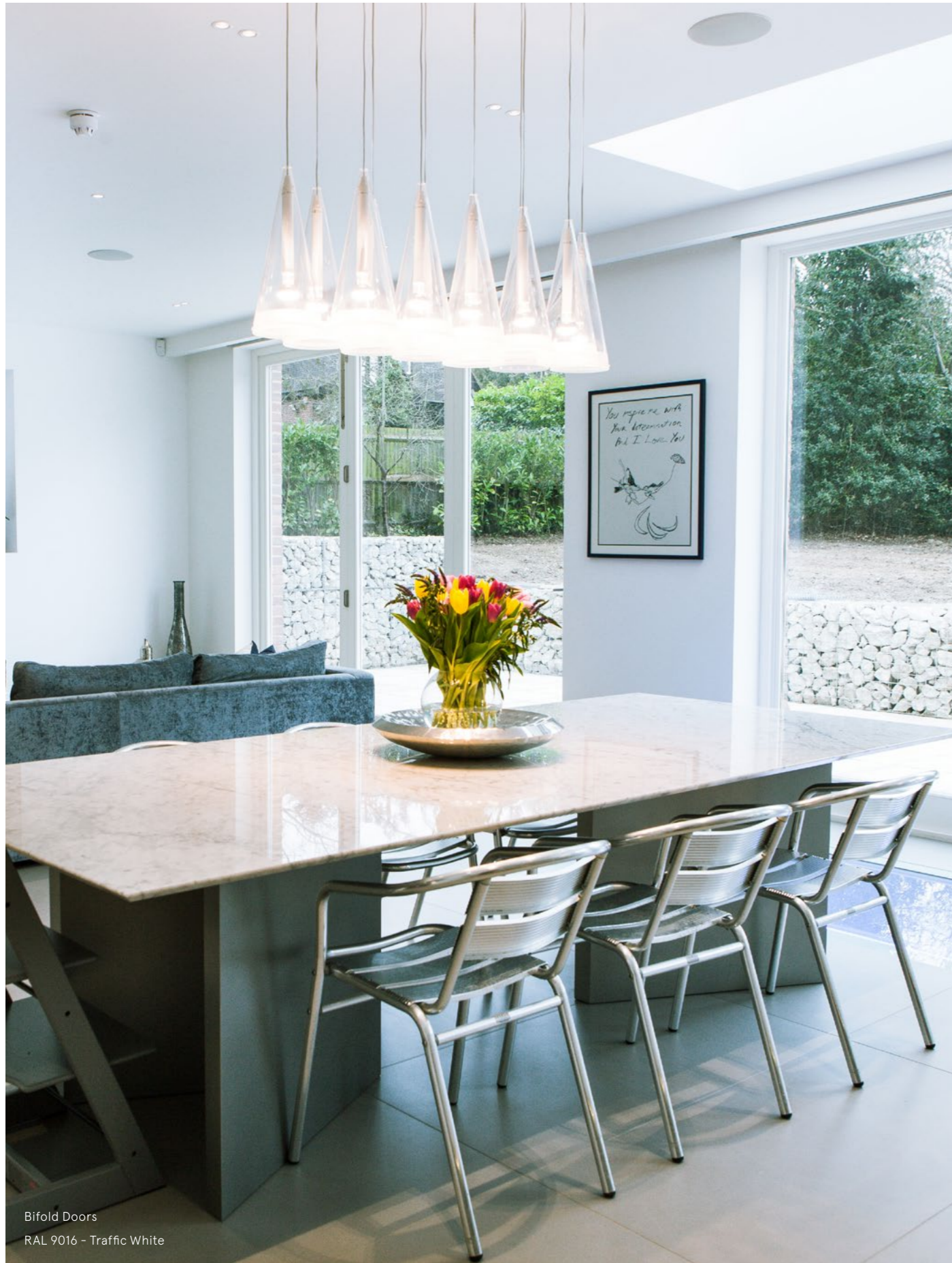
Bifold Doors RAL 9016 - Traffic White