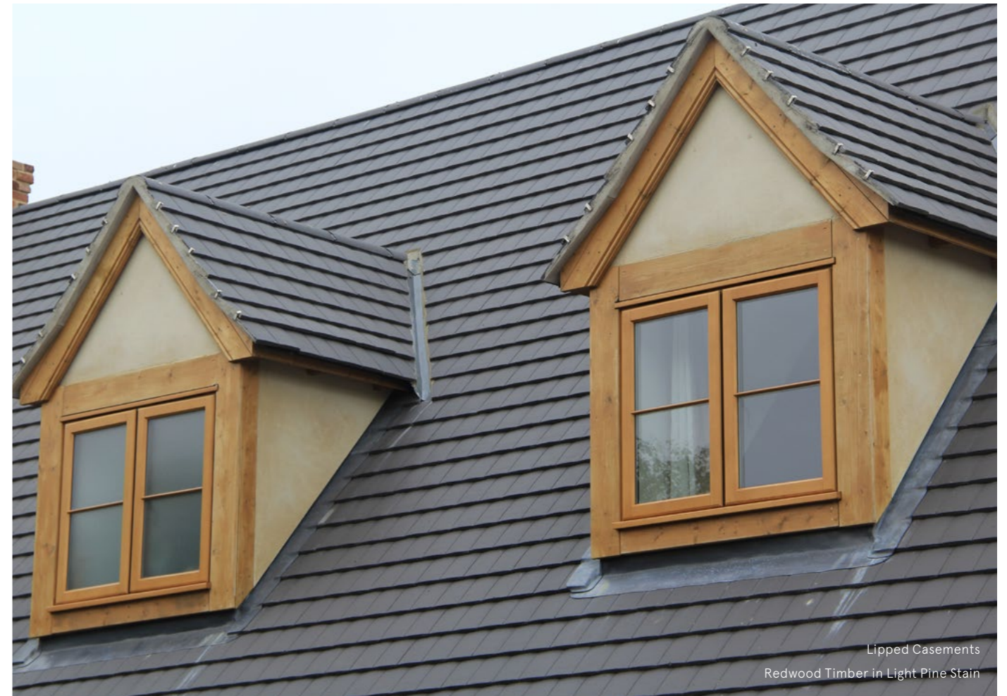
Lipped Casements Redwood Timber in Light Pine Stain