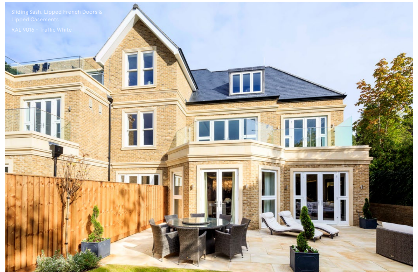
Sliding Sash, Lipped French Doors & Lipped Casements RAL 9016 - Traffic White