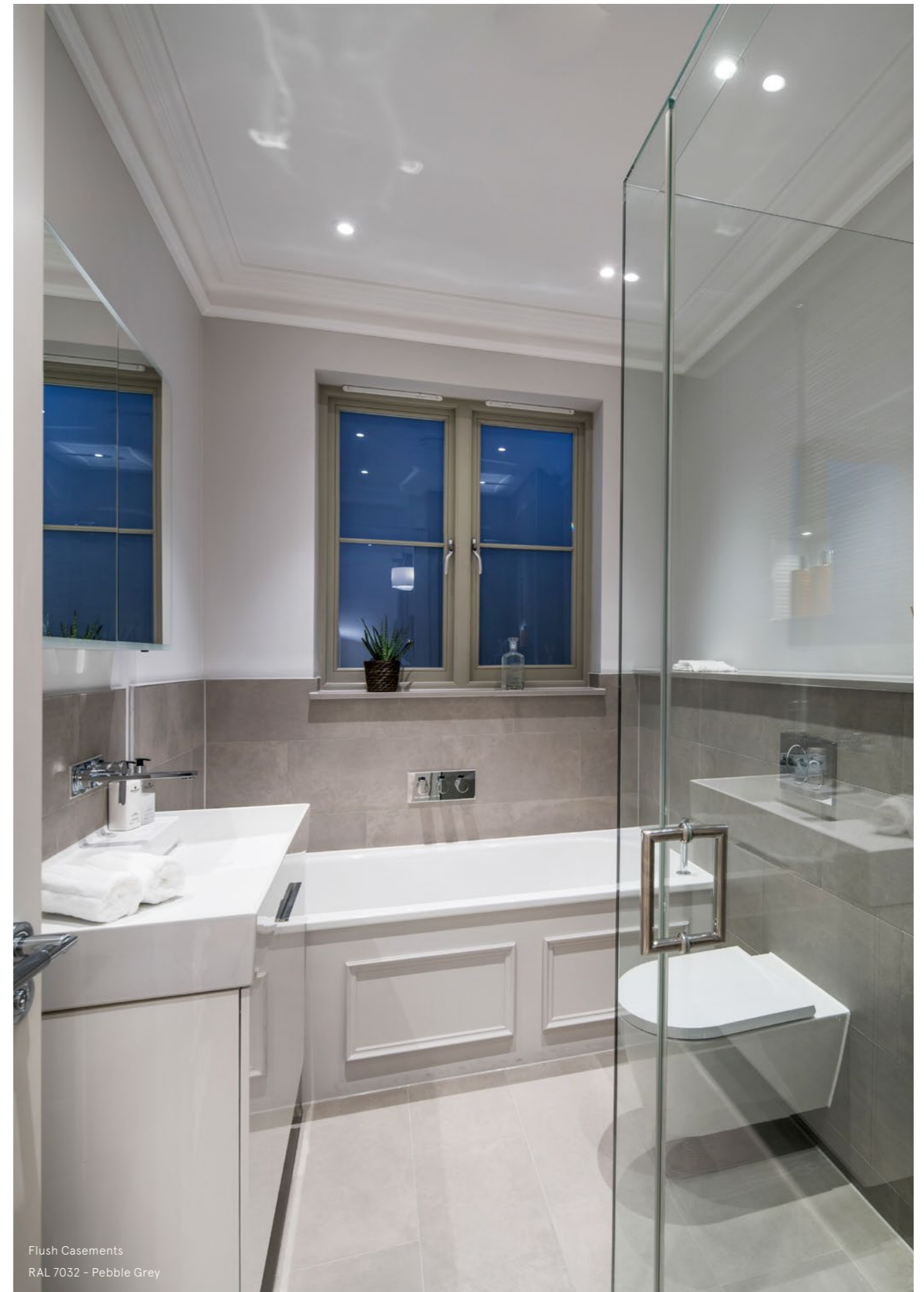
Flush Casements RAL 7032 - Pebble Grey