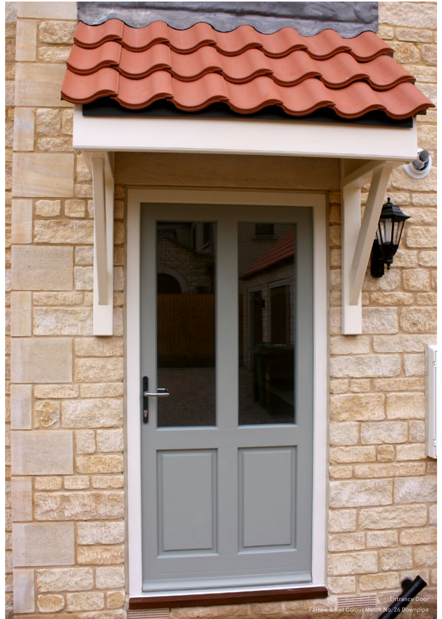
Entrance Door Farrow & Ball Colour Match No. 26 Downpipe