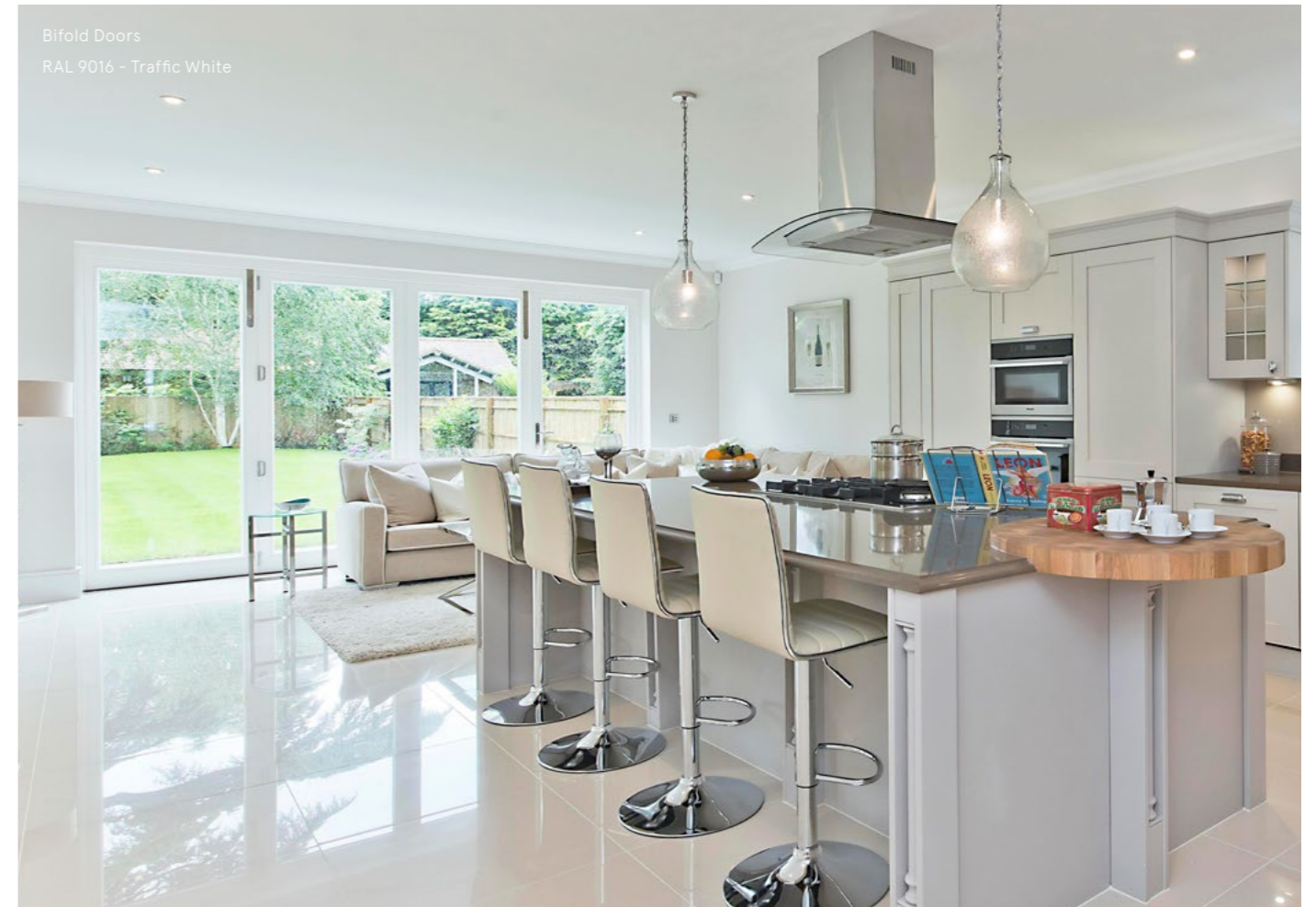
Bifold Doors RAL 9016 - Traffic White