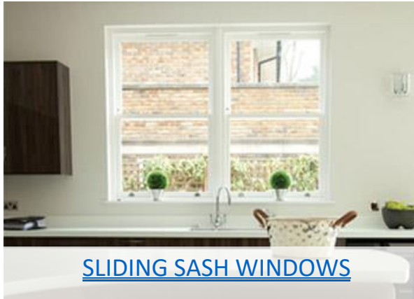
SLIDING SASH WINDOWS