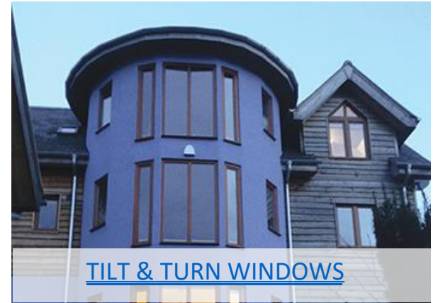
TILT & TURN WINDOWS