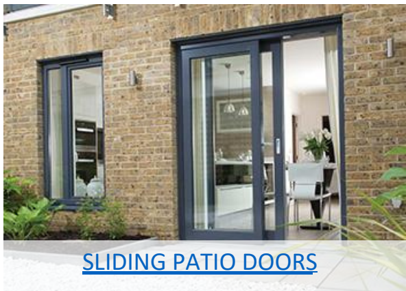
SLIDING PATIO DOORS