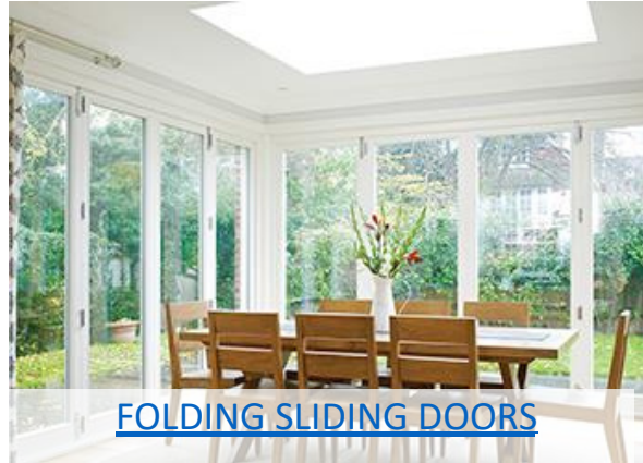
FOLDING SLIDING DOORS