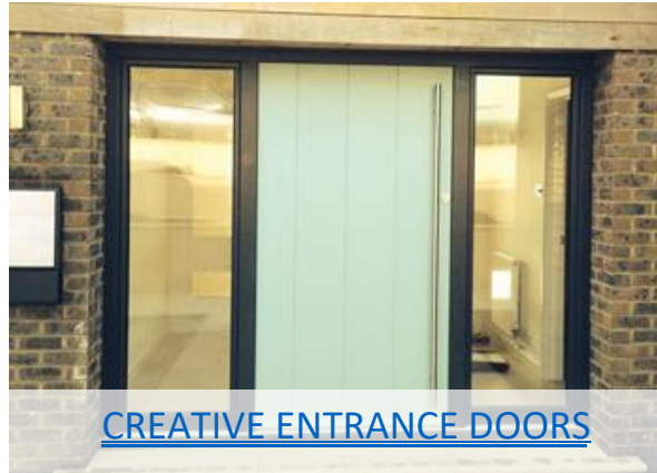
CREATIVE ENTRANCE DOORS