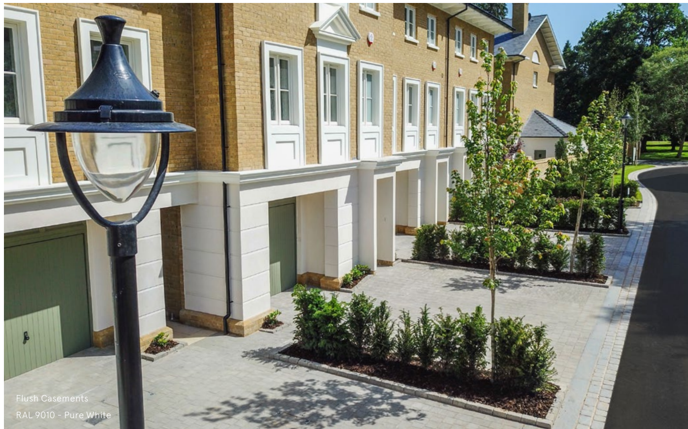
Flush Casements RAL 9010 - Pure White