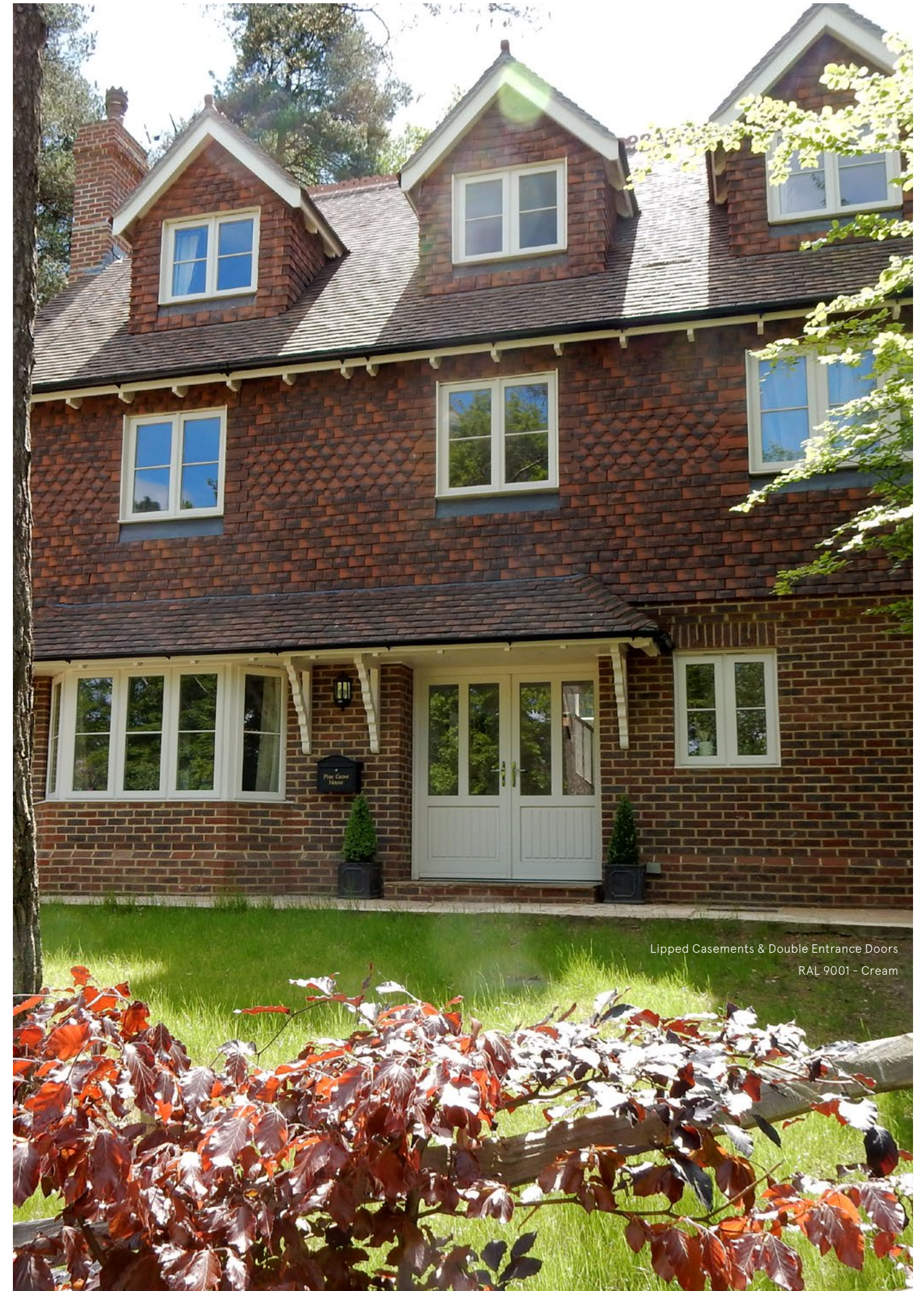
Lipped Casements & Double Entrance Doors RAL 9001 - Cream