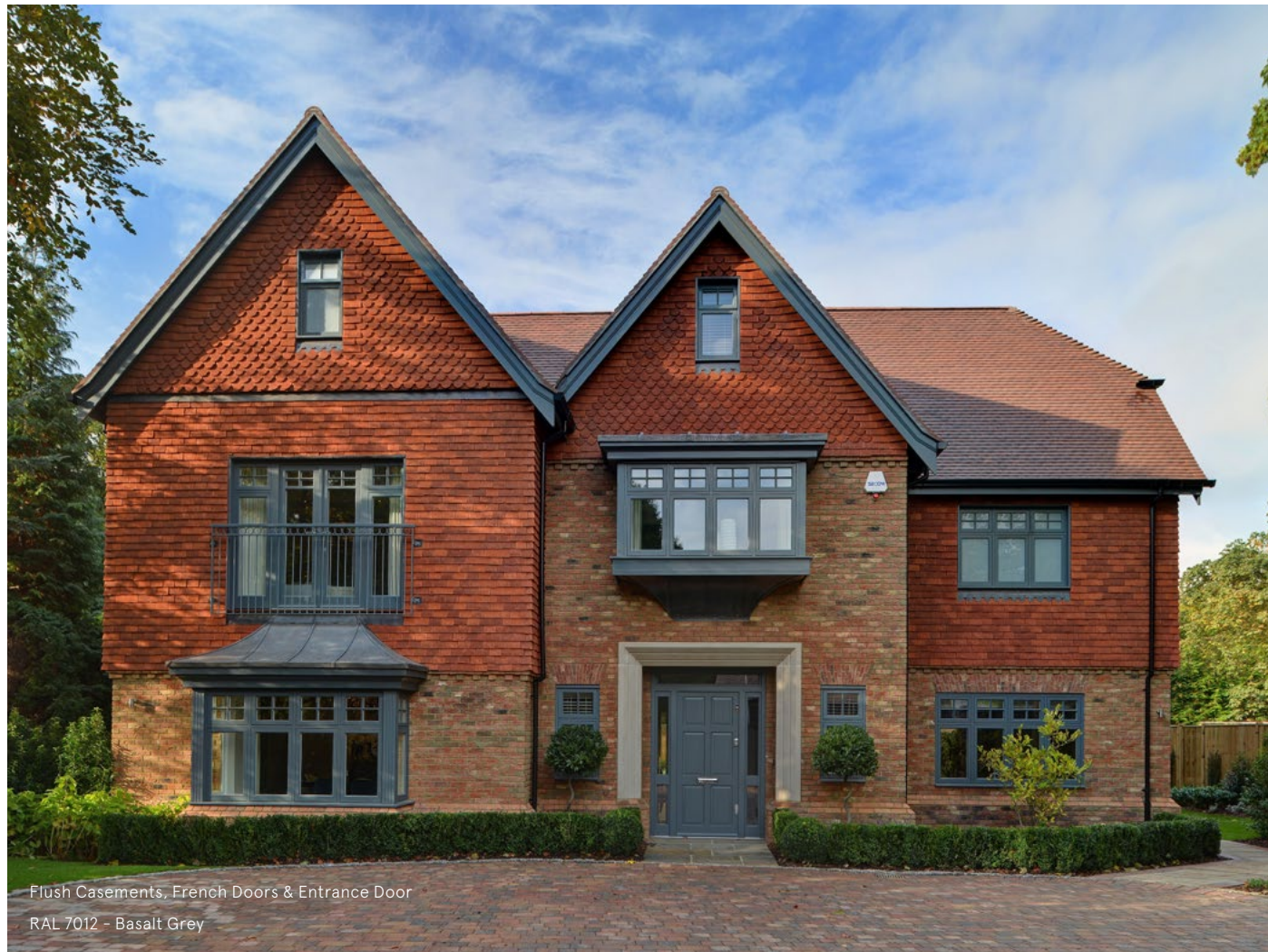
Flush Casements, French Doors & Entrance Door RAL 7012 - Basalt Grey