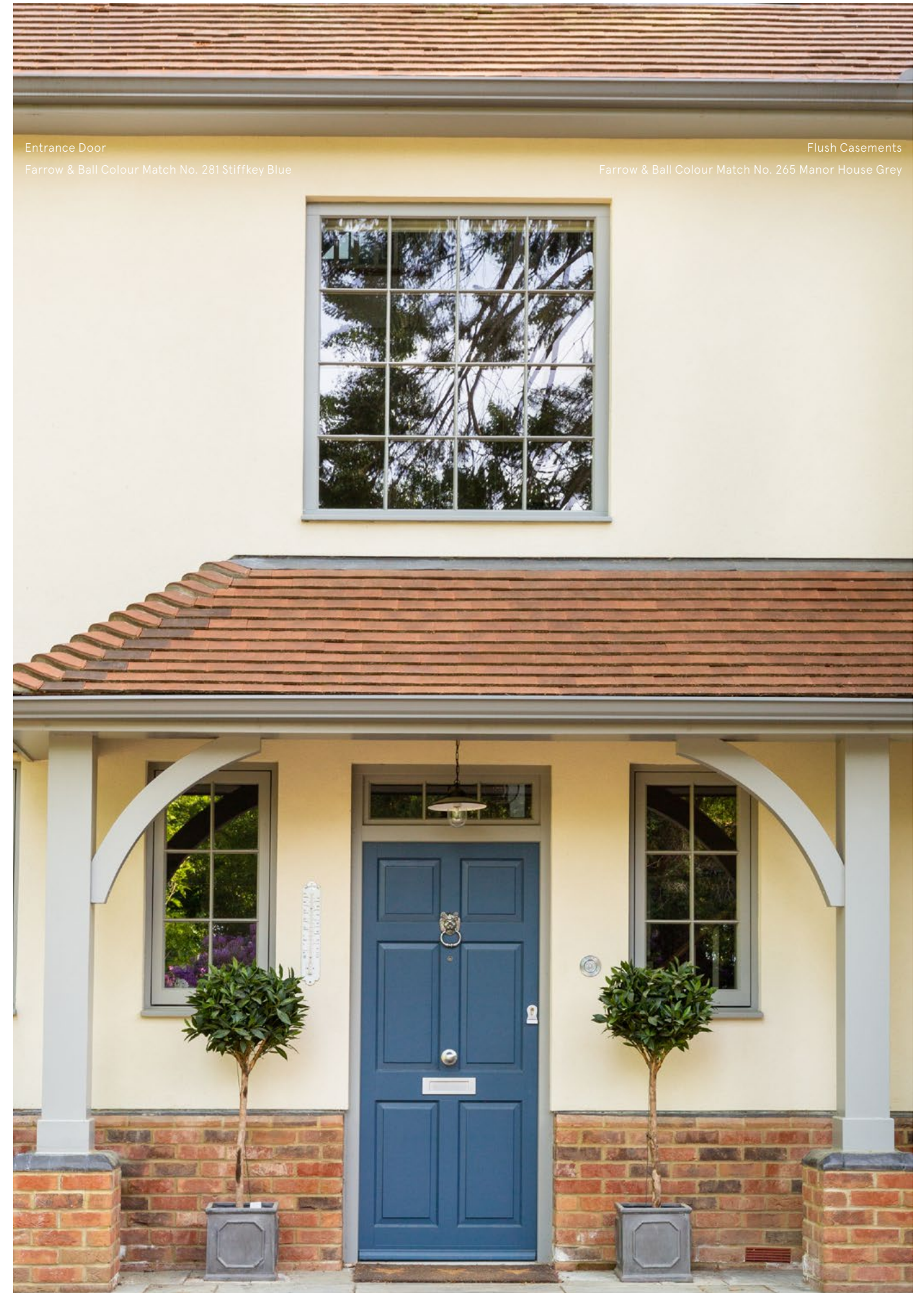
Entrance Door Farrow & Ball Colour Match No. 281 Stiffkey Blue