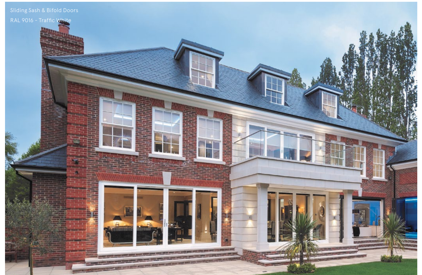
Sliding Sash & Bifold Doors RAL 9016 - Traffic White