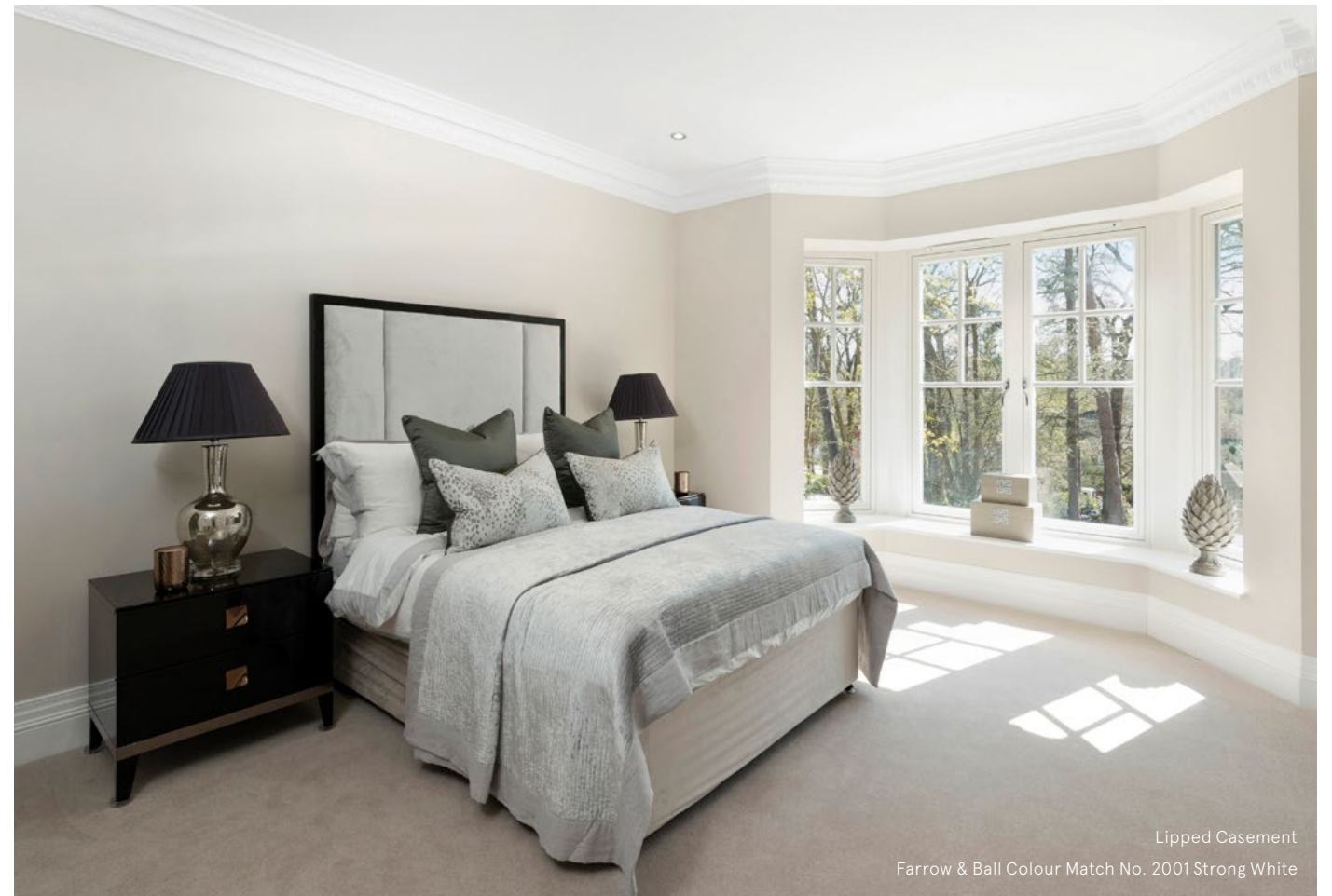
Lipped Casement Farrow & Ball Colour Match No. 2001 Strong White