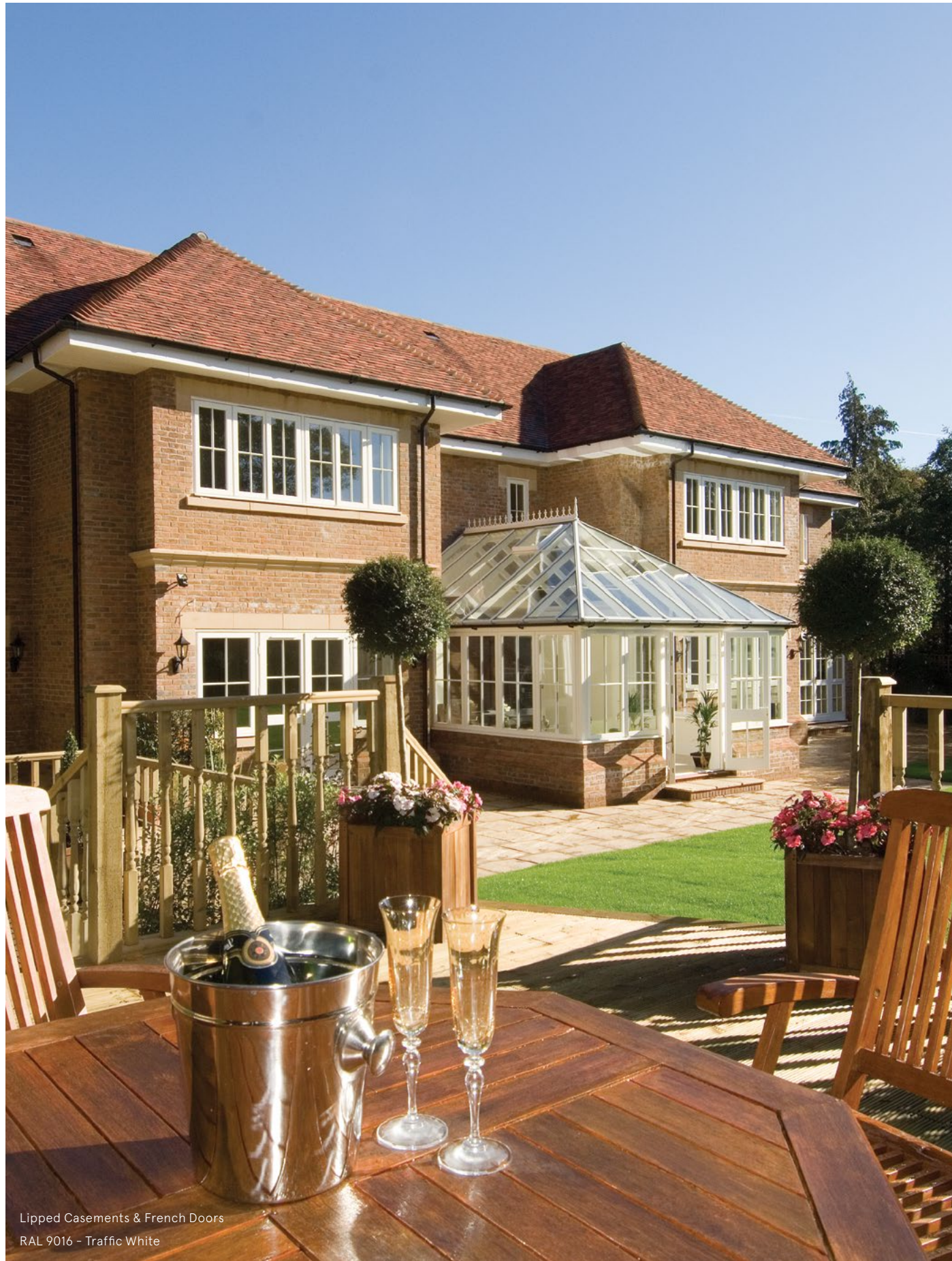
Lipped Casements & French Doors RAL 9016 - Traffic White