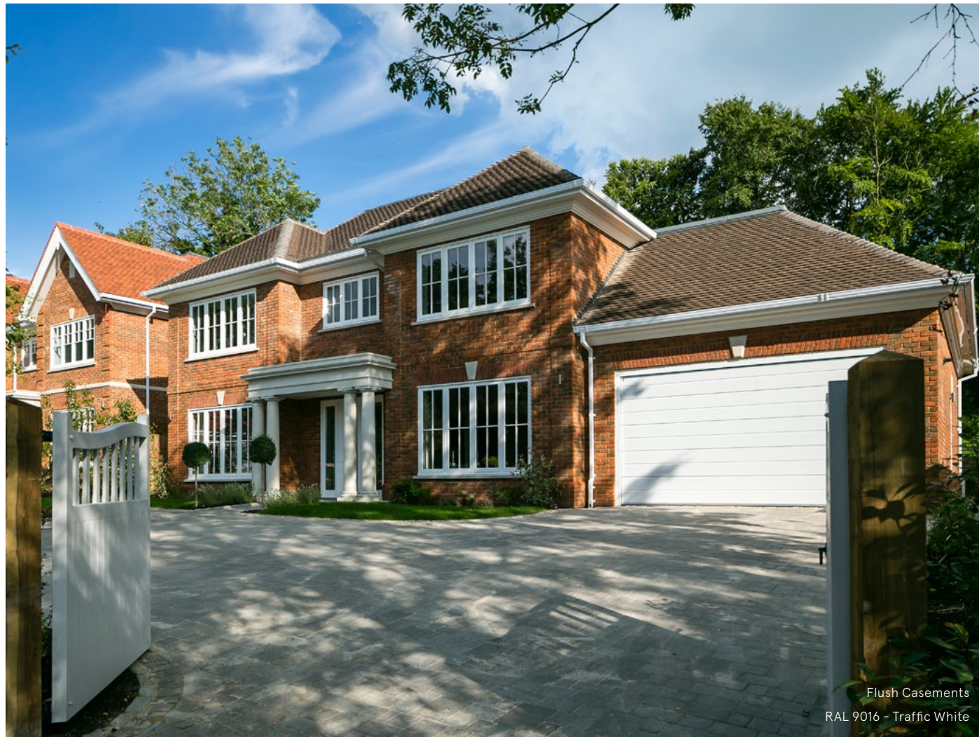
Flush Casements RAL 9016 - Traffic White