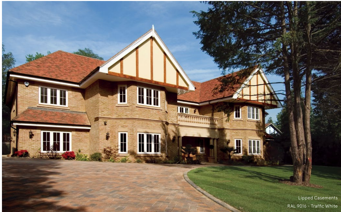
Lipped Casements RAL 9016 - Traffic White