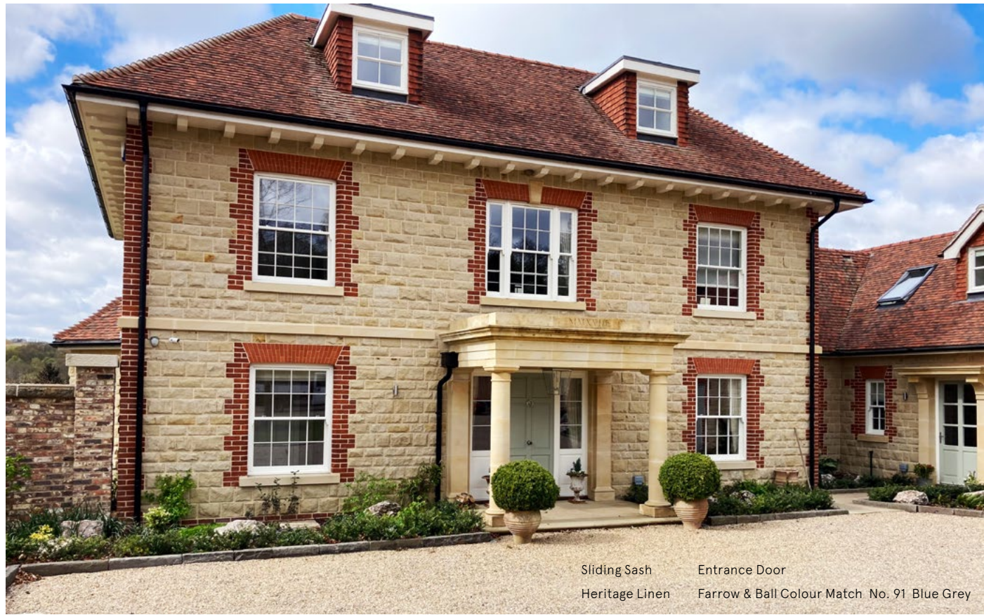
Sliding Sash Entrance Door Heritage Linen Farrow & Ball Colour Match No. 91 Blue Grey