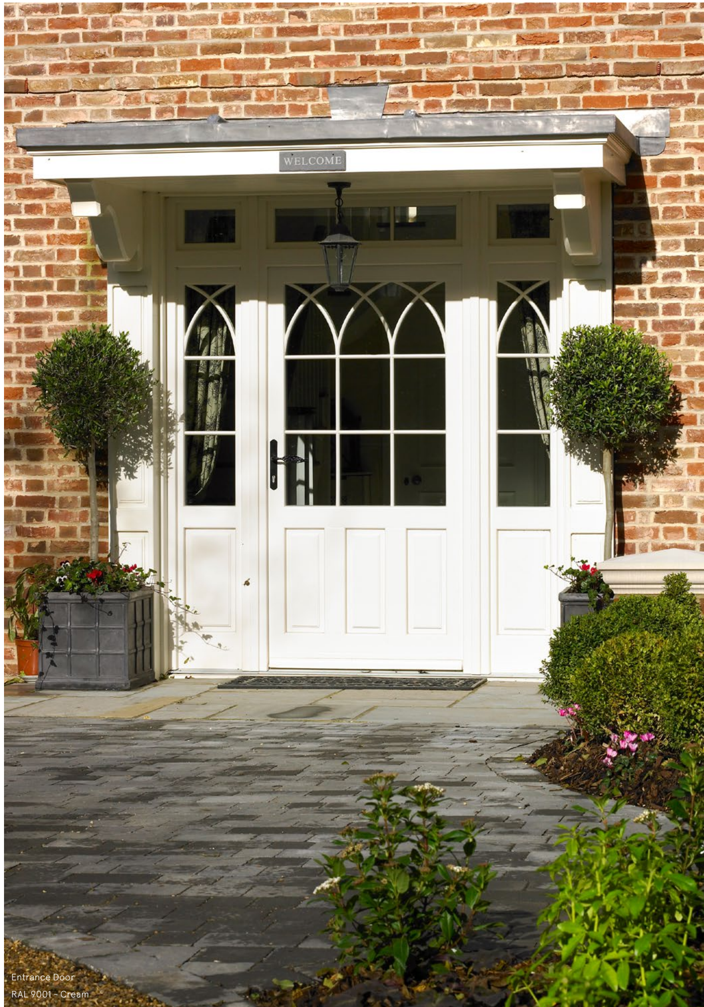
Entrance Door RAL 9001 - Cream