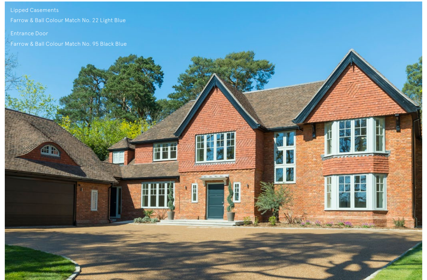
Lipped Casements Farrow & Ball Colour Match No. 22 Light Blue Entrance Door Farrow & Ball Colour Match No. 95 Black Blue