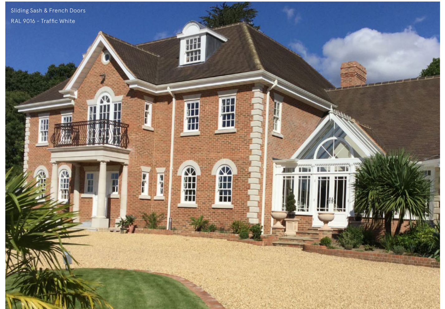
Sliding Sash & French Doors RAL 9016 - Traffic White