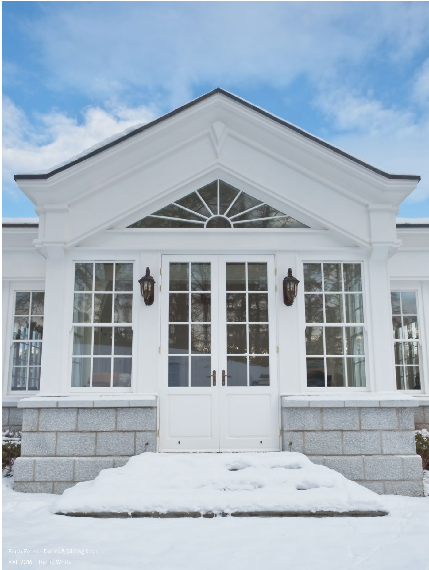
Flush French Doors & Sliding Sash RAL 9016 - Traffic White