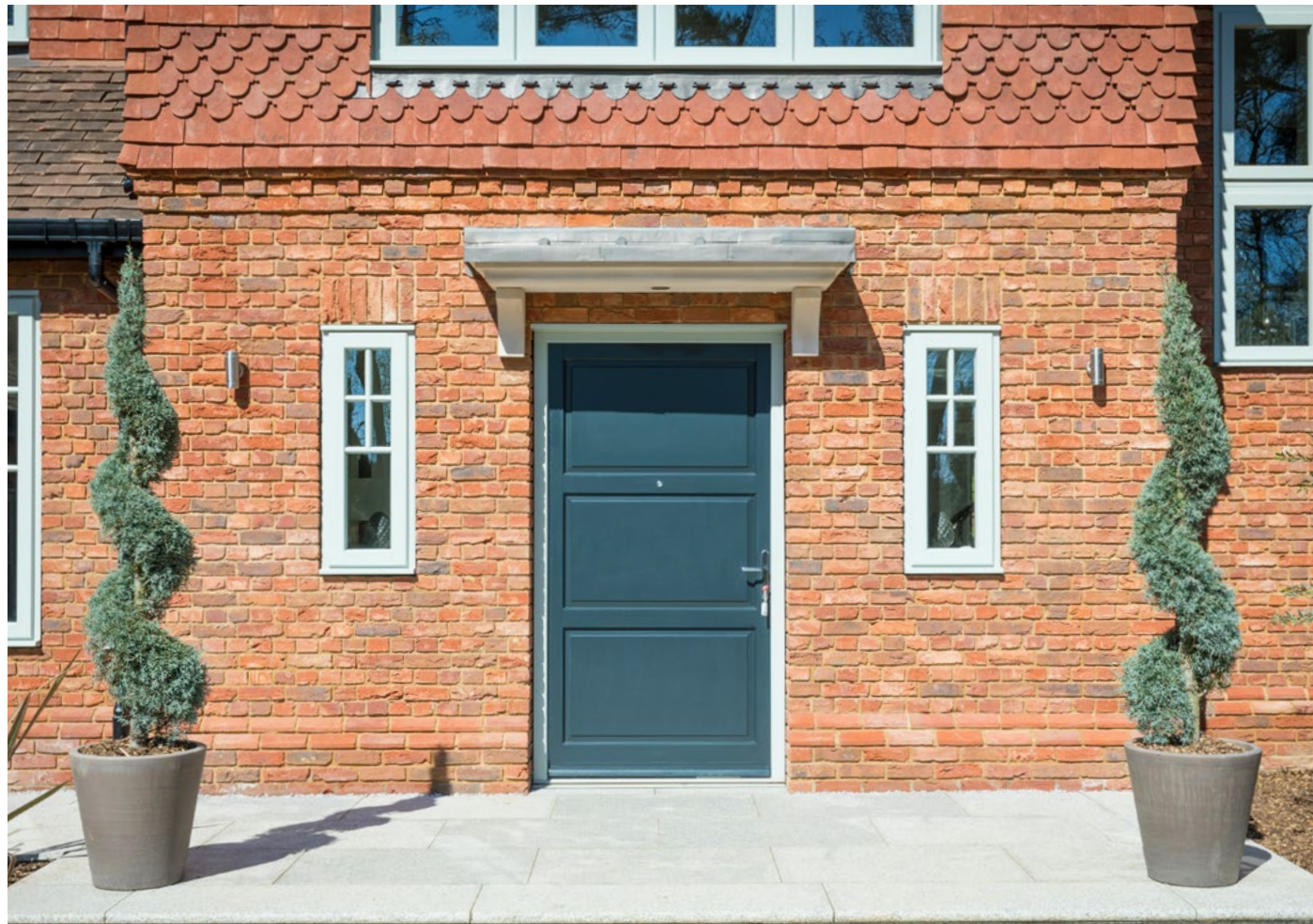
Lipped Casements Farrow & Ball Colour Match No. 22 Light Blue