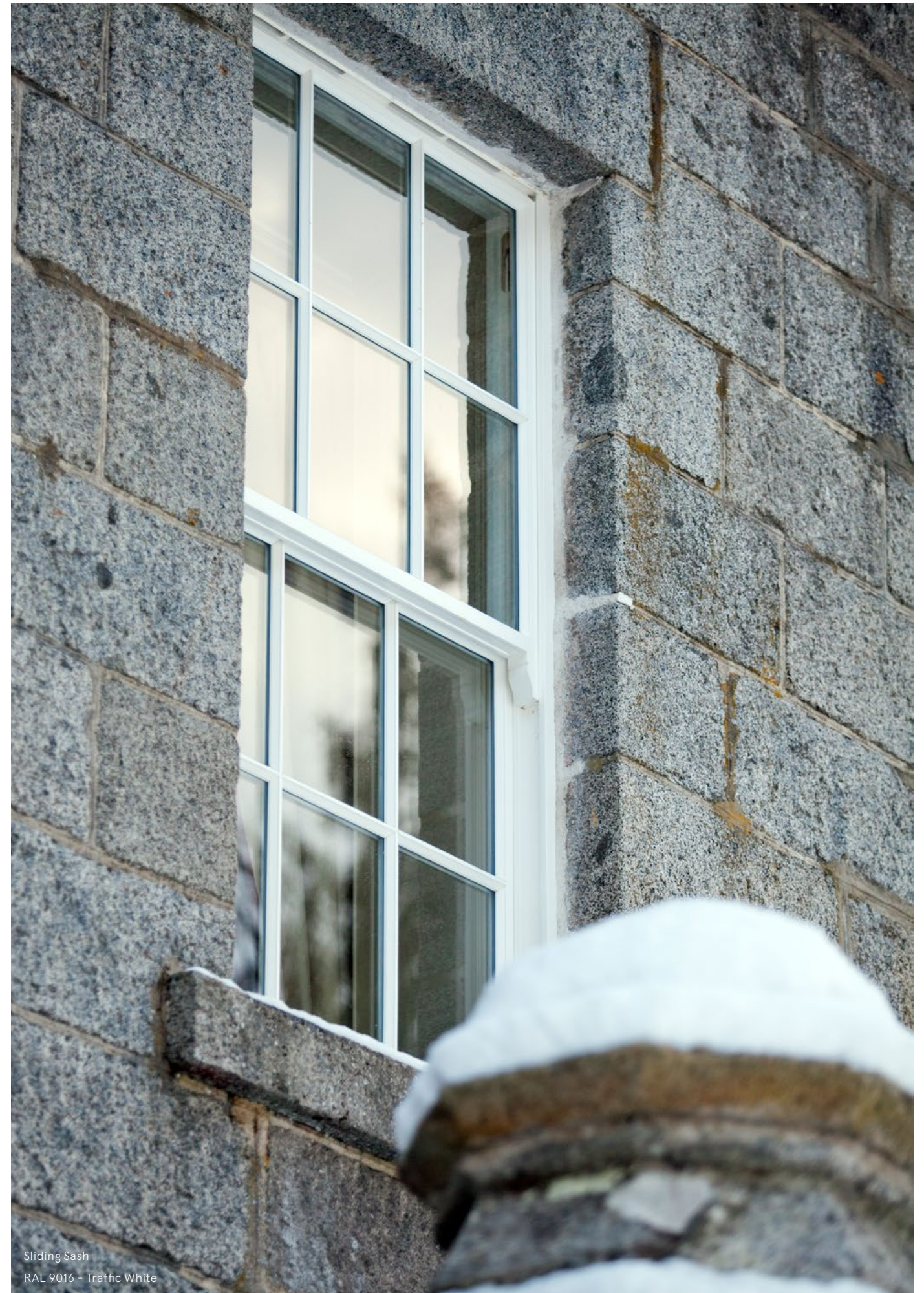
Sliding Sash RAL 9016 - Traffic White