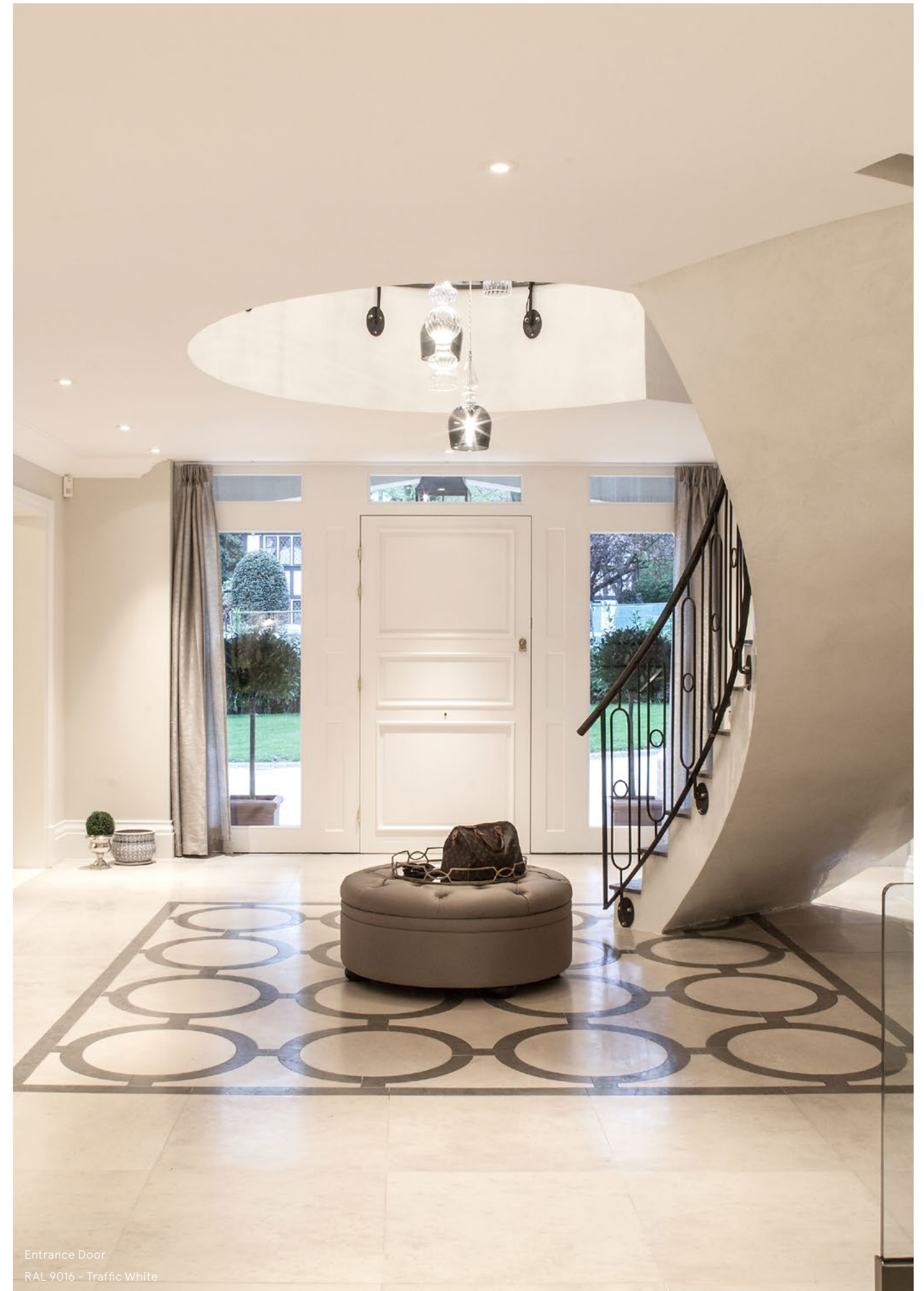
Entrance Door RAL 9016 - Traffic White