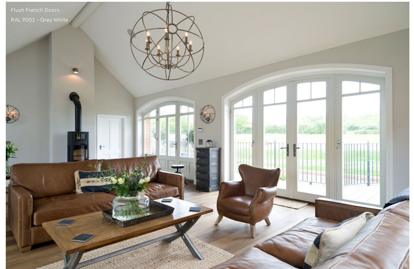
Flush French Doors RAL 9002 - Grey White