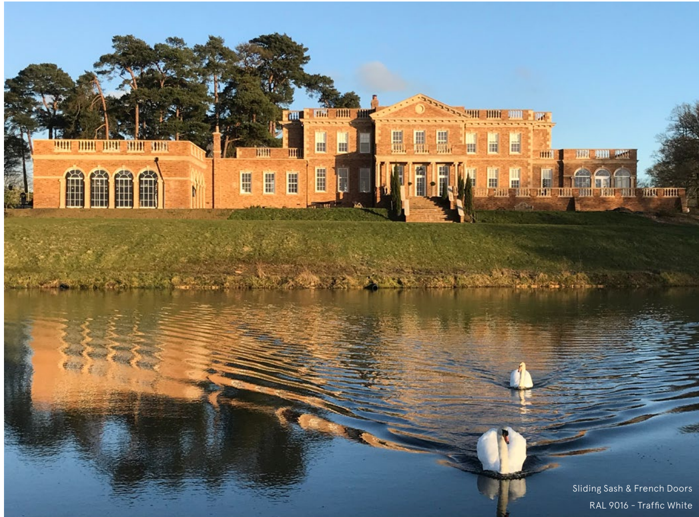
Sliding Sash & French Doors RAL 9016 - Traffic White