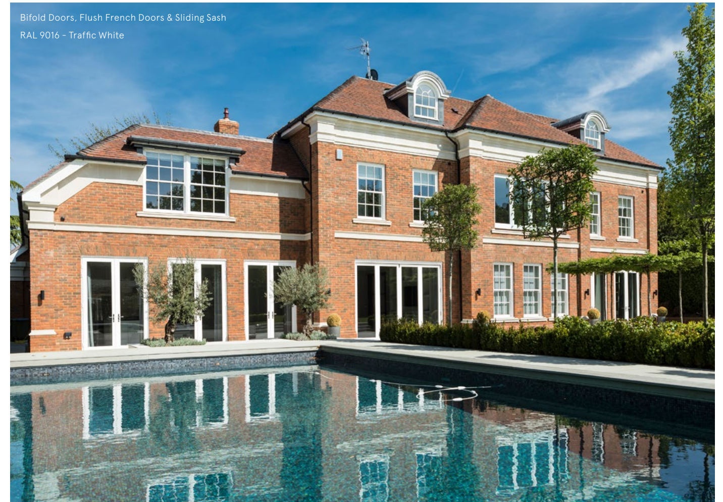
Bifold Doors, Flush French Doors & Sliding Sash RAL 9016 - Traffic White