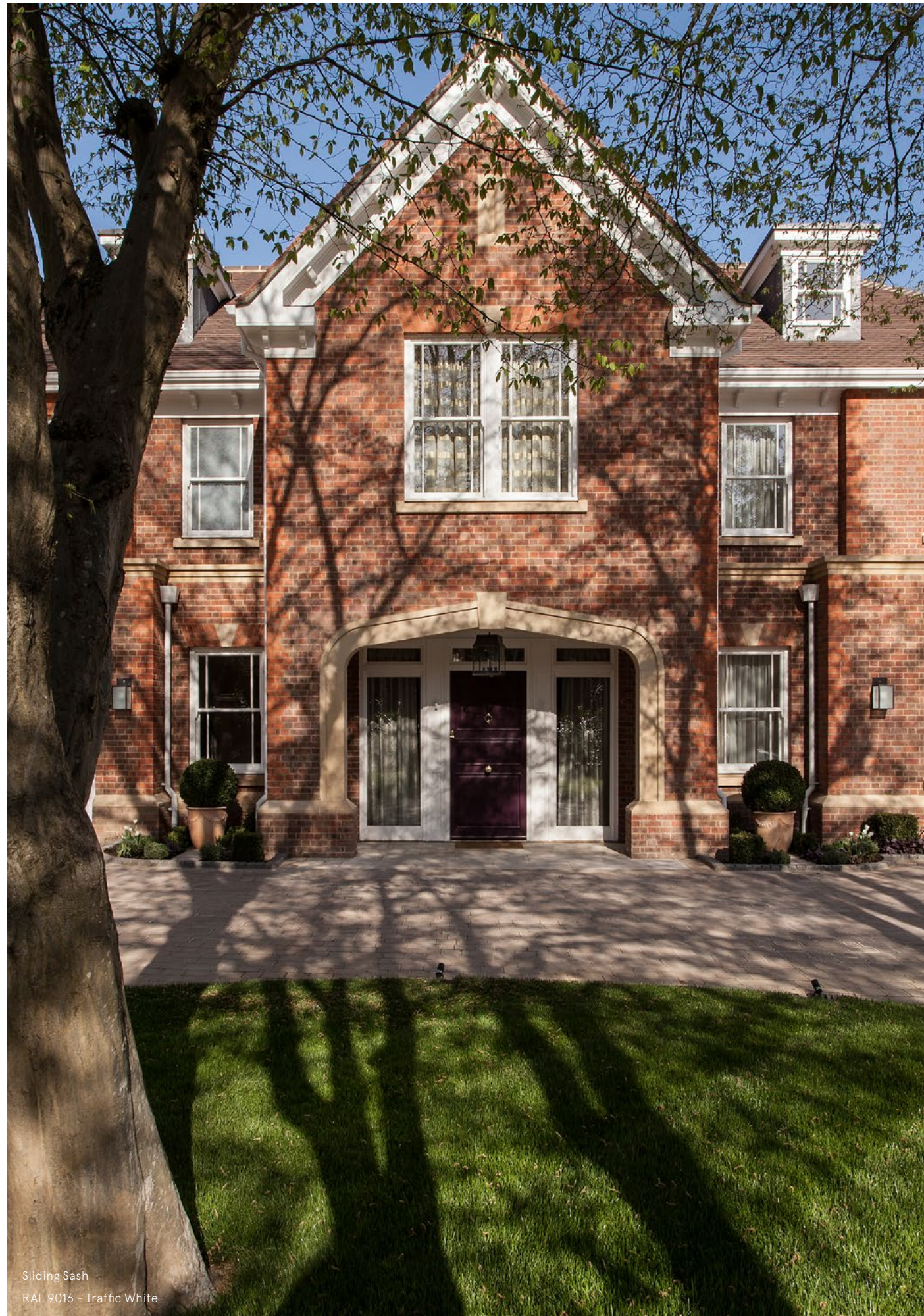
Sliding Sash RAL 9016 - Traffic White