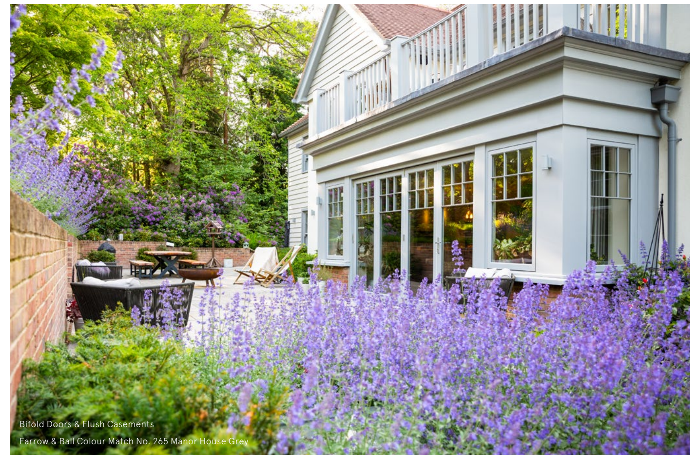
Bifold Doors & Flush Casements Farrow & Ball Colour Match No. 265 Manor House Grey