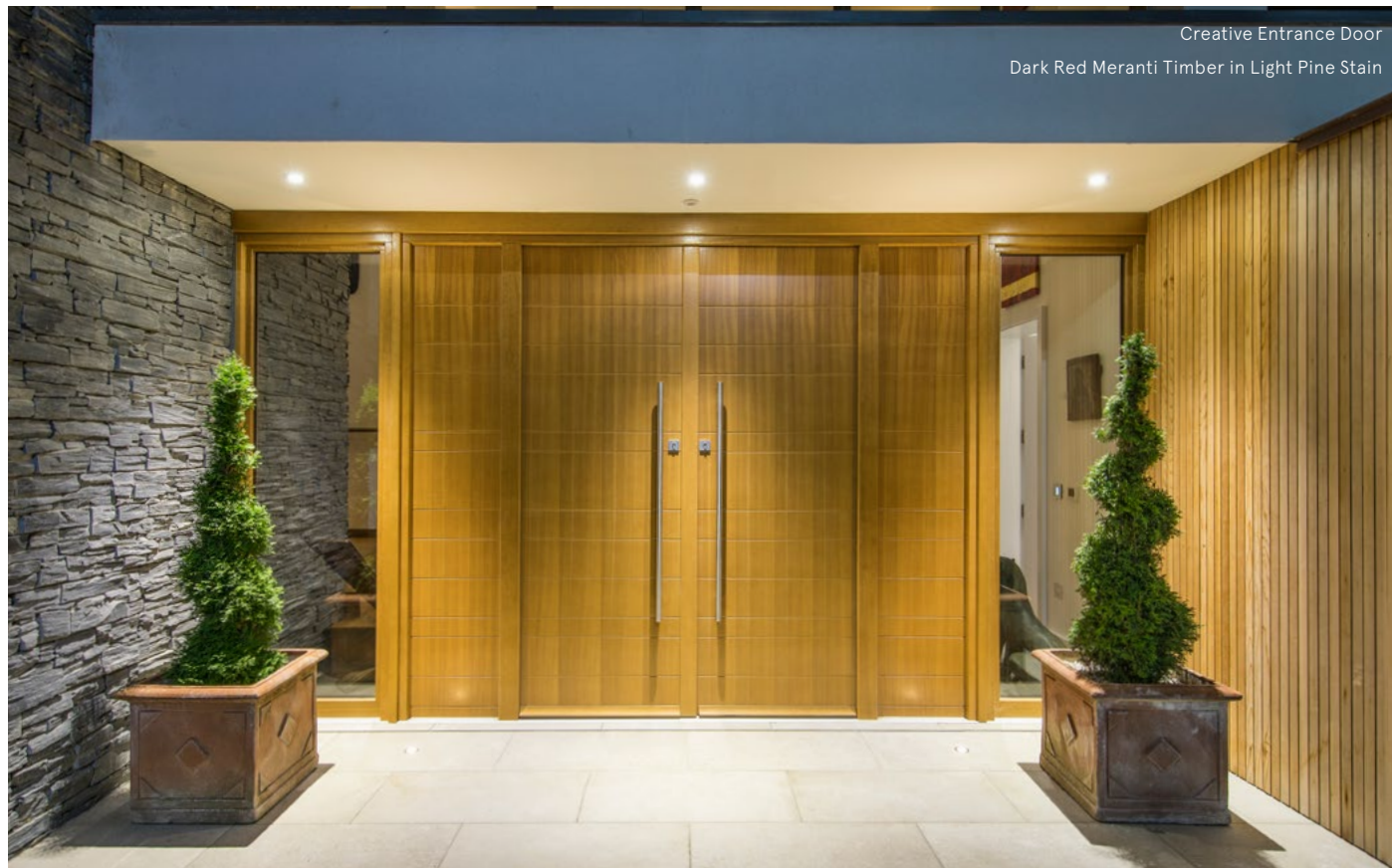
Creative Entrance Door Dark Red Meranti Timber in Light Pine Stain