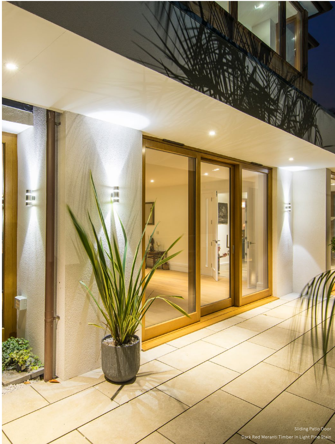
Sliding Patio Door Dark Red Meranti Timber in Light Pine Stain