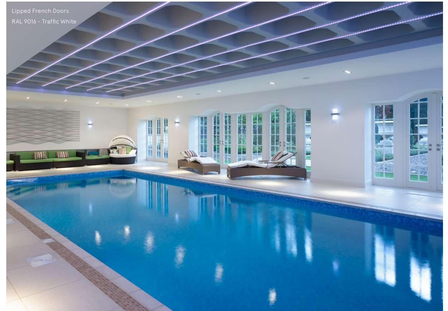
Lipped French Doors RAL 9016 - Traffic White