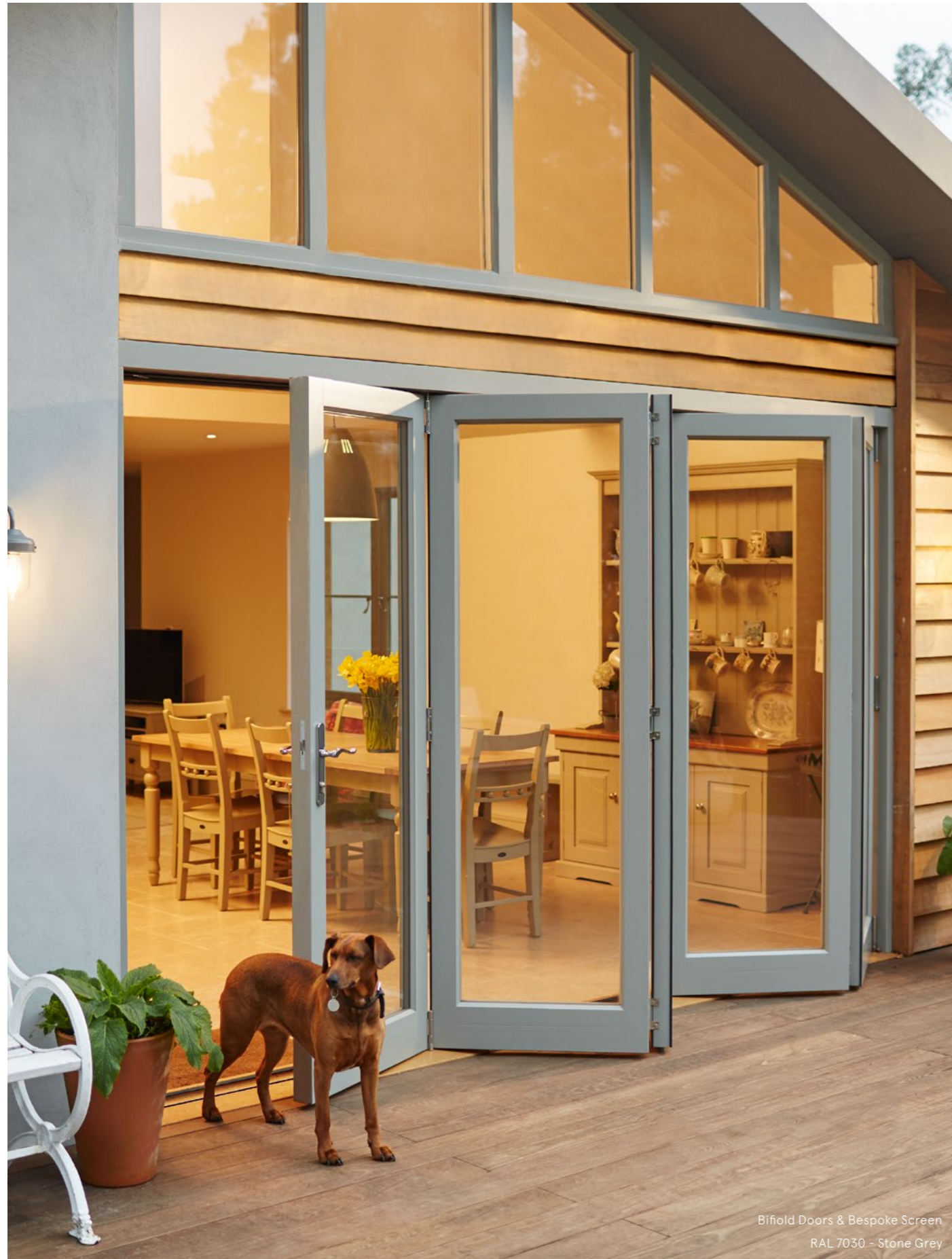
Bifold Doors & Bespoke Screen RAL 7030 - Stone Grey