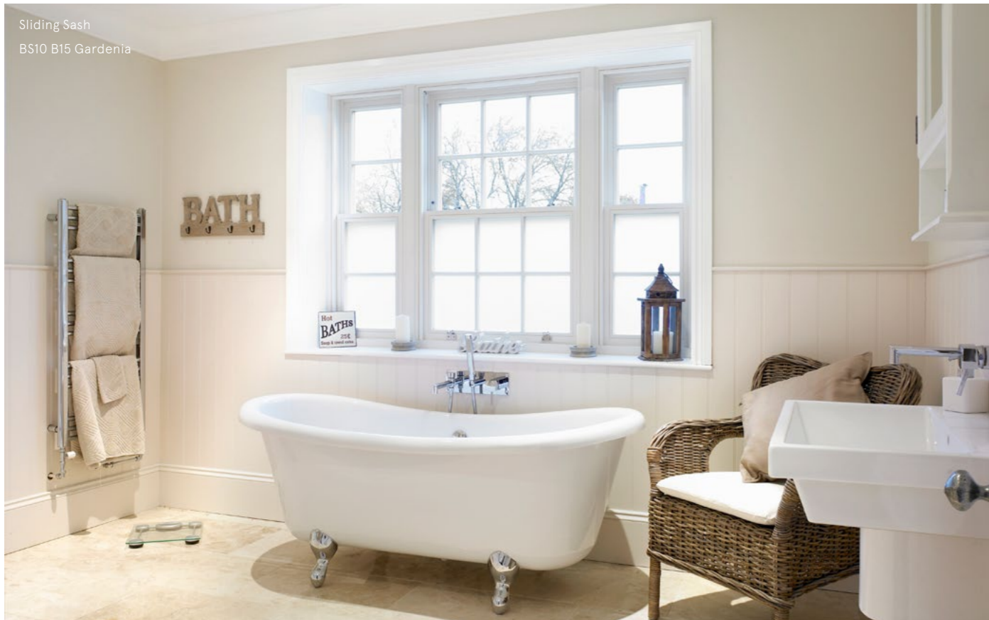
Sliding Sash BS10 B15 Gardenia