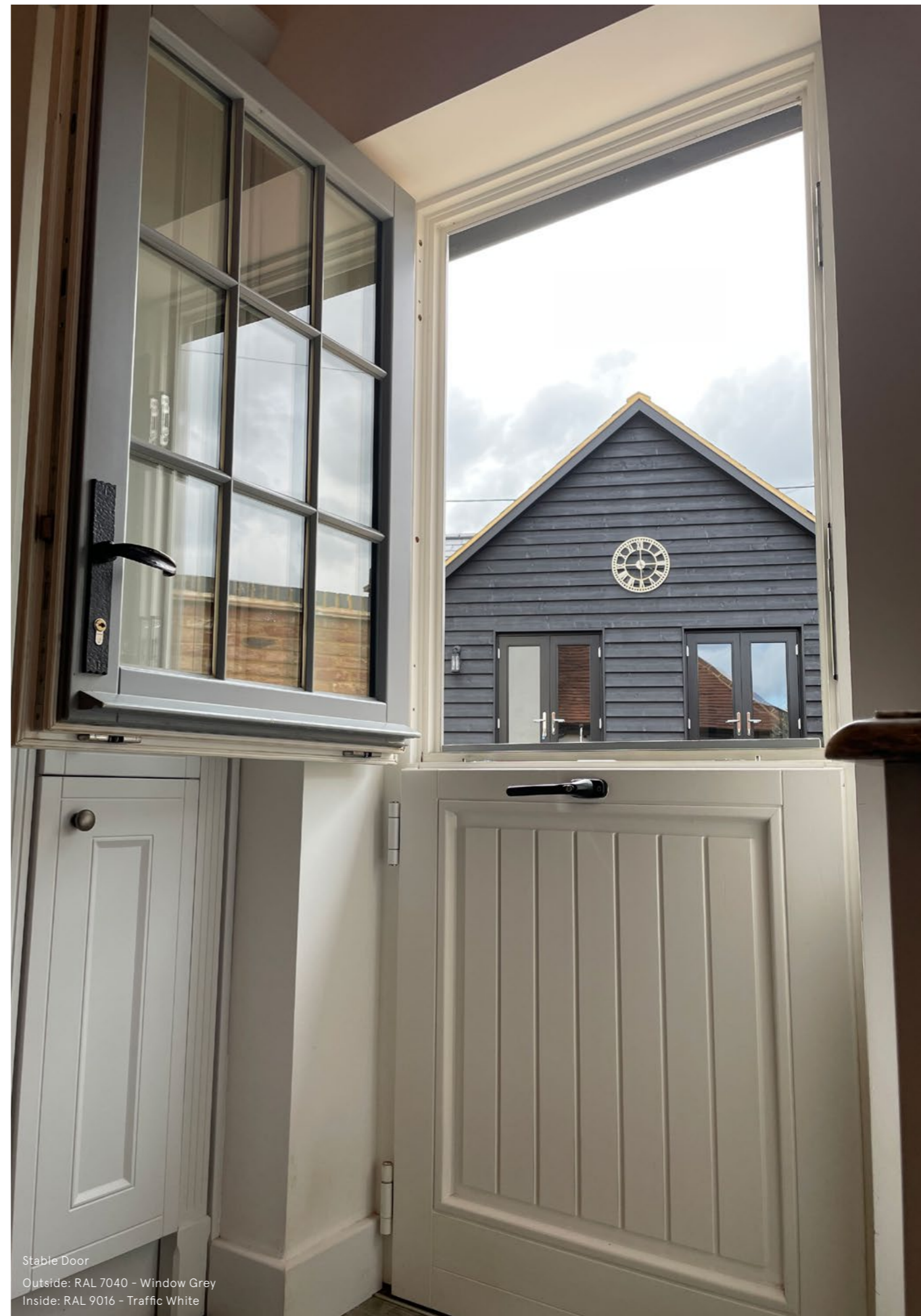
Stable Door Outside: RAL 7040 - Window Grey Inside: RAL 9016 - Traffic White