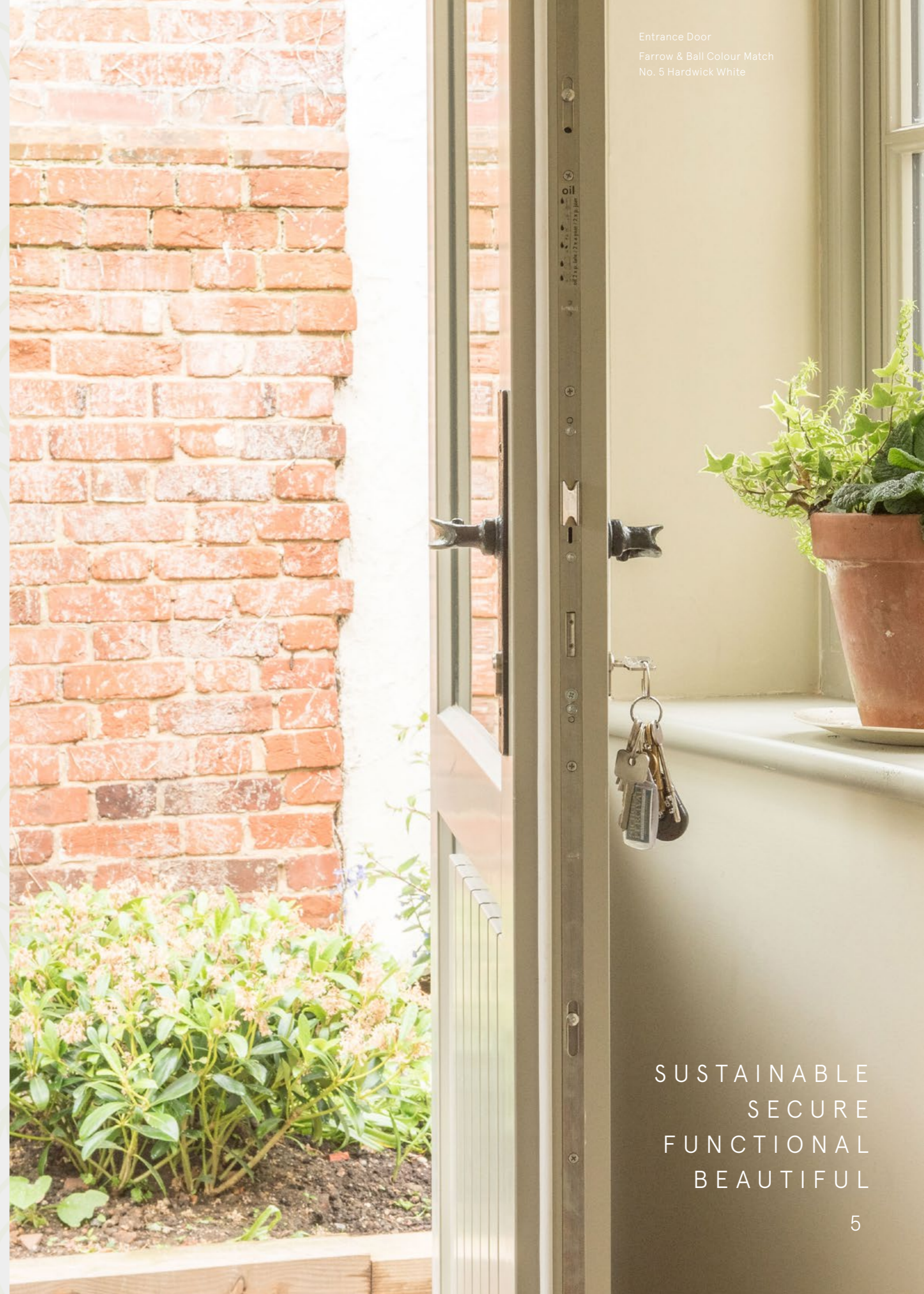
Entrance Door Farrow & Ball Colour Match No. 5 Hardwick White

All information in this brochure is correct to the best of our knowledge at the time of print. Bereco reserve the right to alter products and specification without prior notice. Colours may differ from those illustrated.