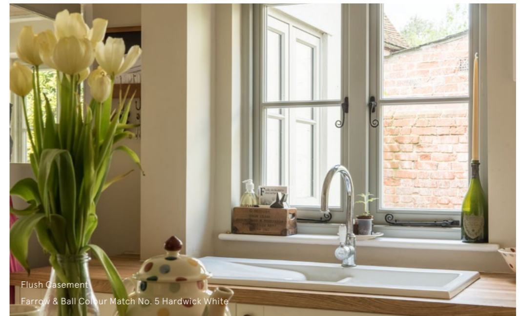
Flush Casement Farrow & Ball Colour Match No. 5 Hardwick White