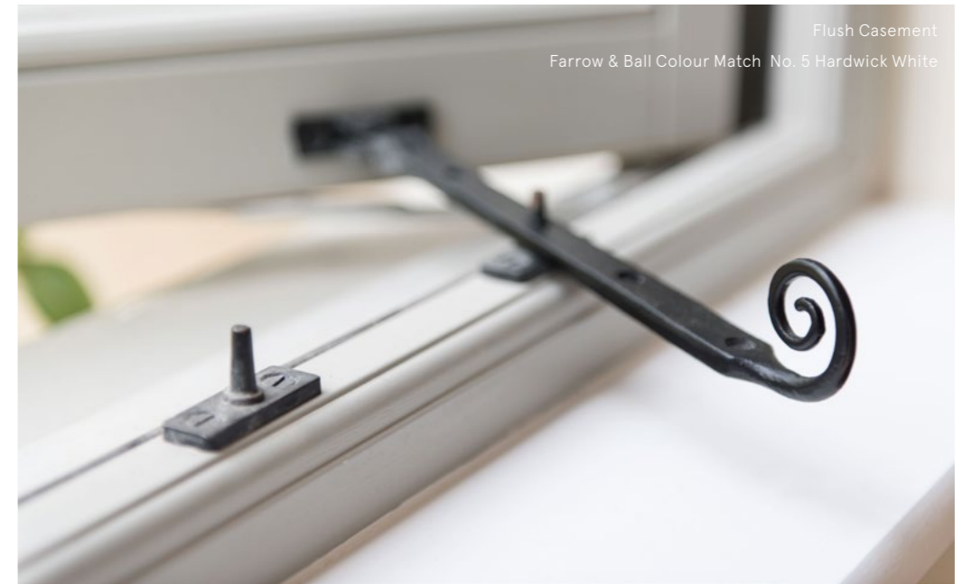
Flush Casement Farrow & Ball Colour Match No. 5 Hardwick White