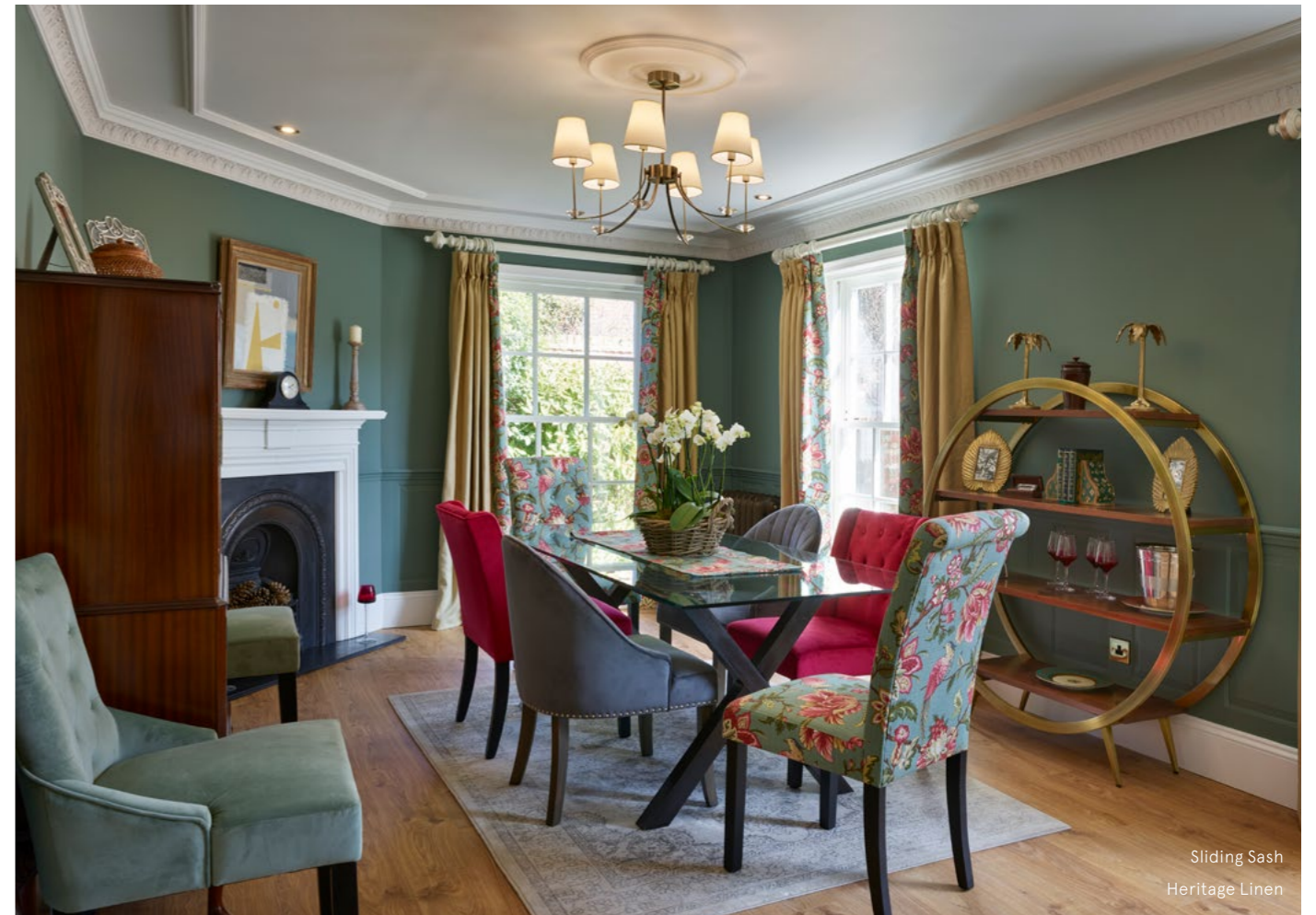
Sliding Sash Heritage Linen