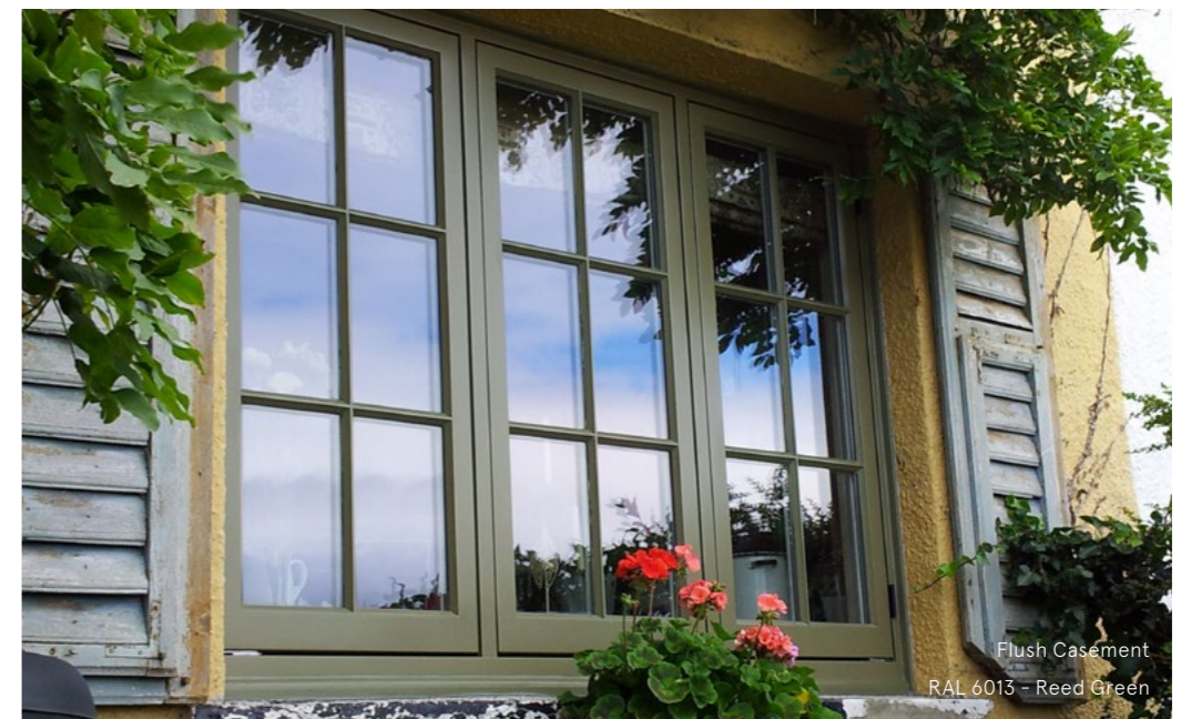
Flush Casement RAL 6013 - Reed Green