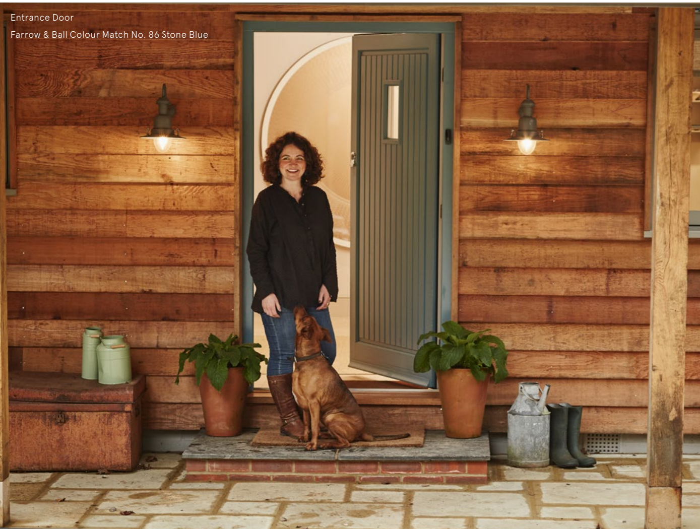
Entrance Door Farrow & Ball Colour Match No. 86 Stone Blue