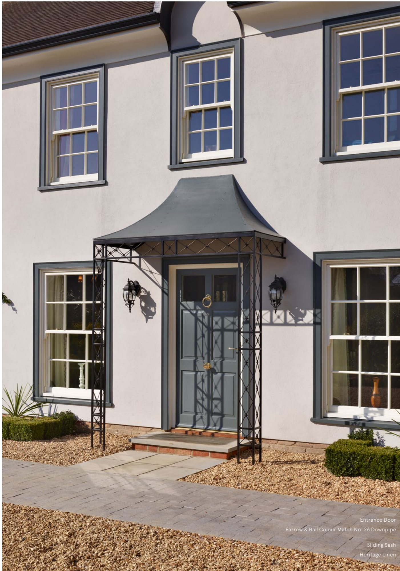
Entrance Door Farrow & Ball Colour Match No. 26 Downpipe Sliding Sash Heritage Linen