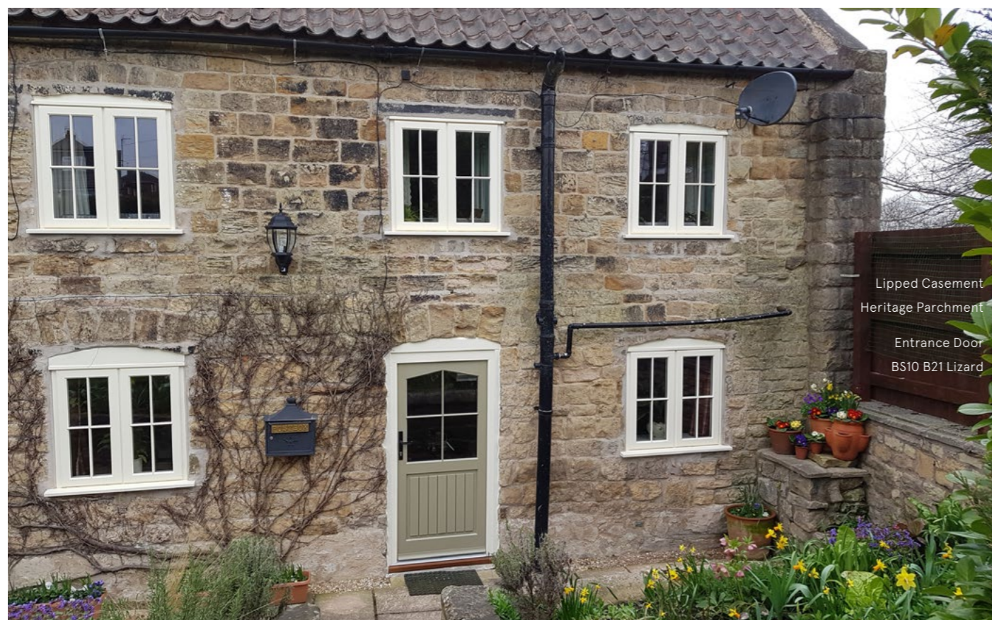
Lipped Casement Heritage Parchment Entrance Door BS10 B21 Lizard