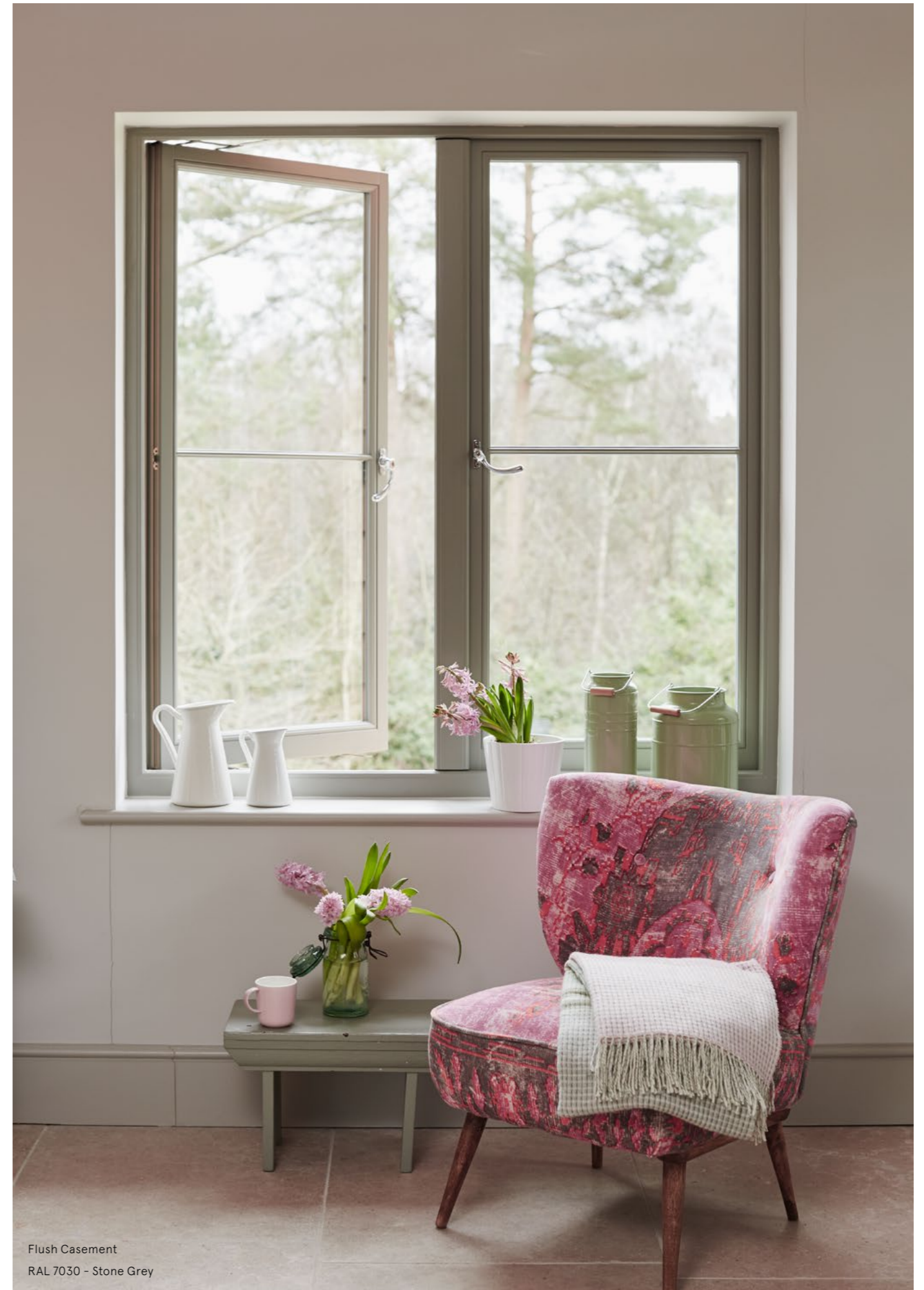
Flush Casement RAL 7030 - Stone Grey