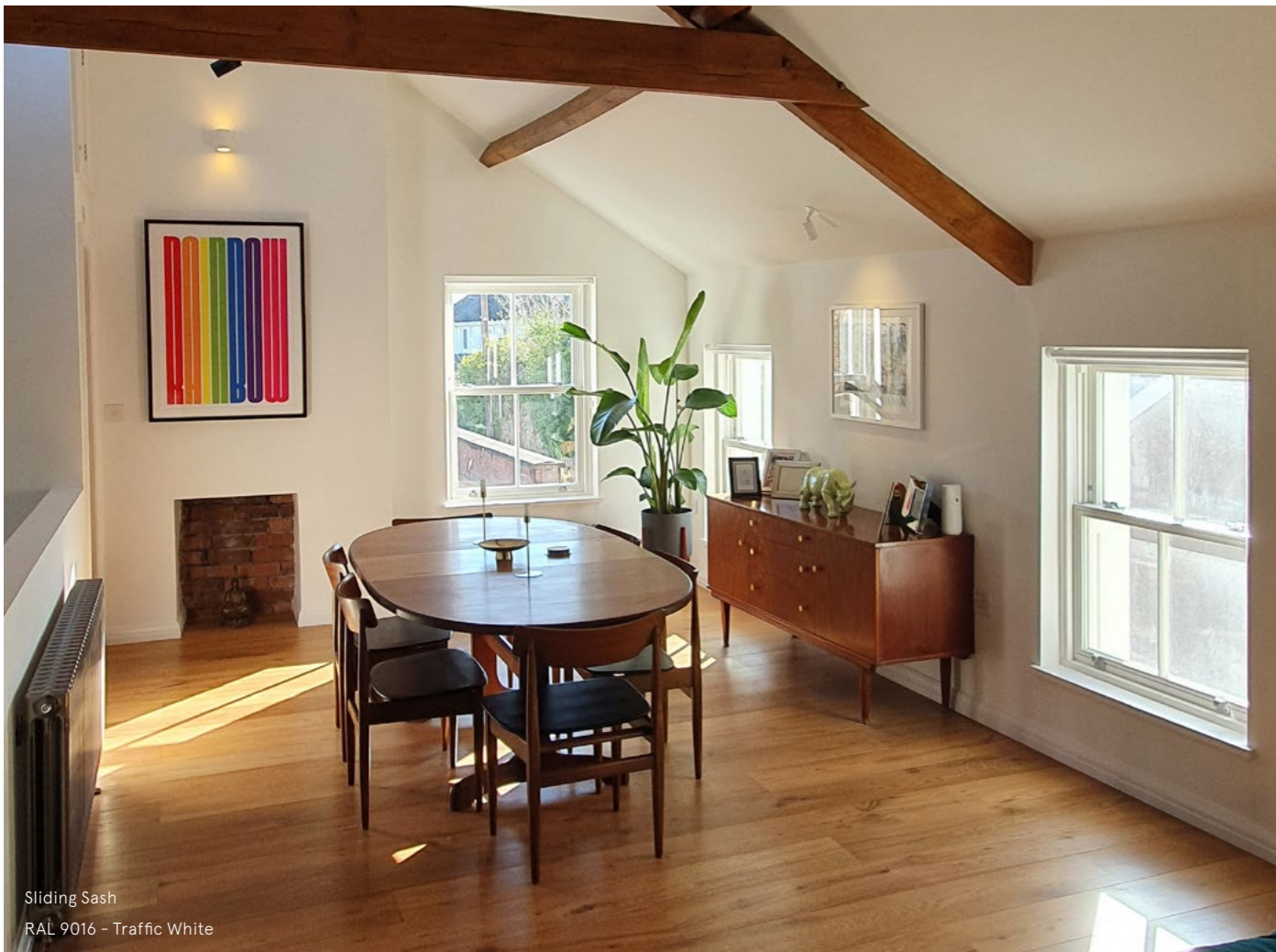
Sliding Sash RAL 9016 - Traffic White