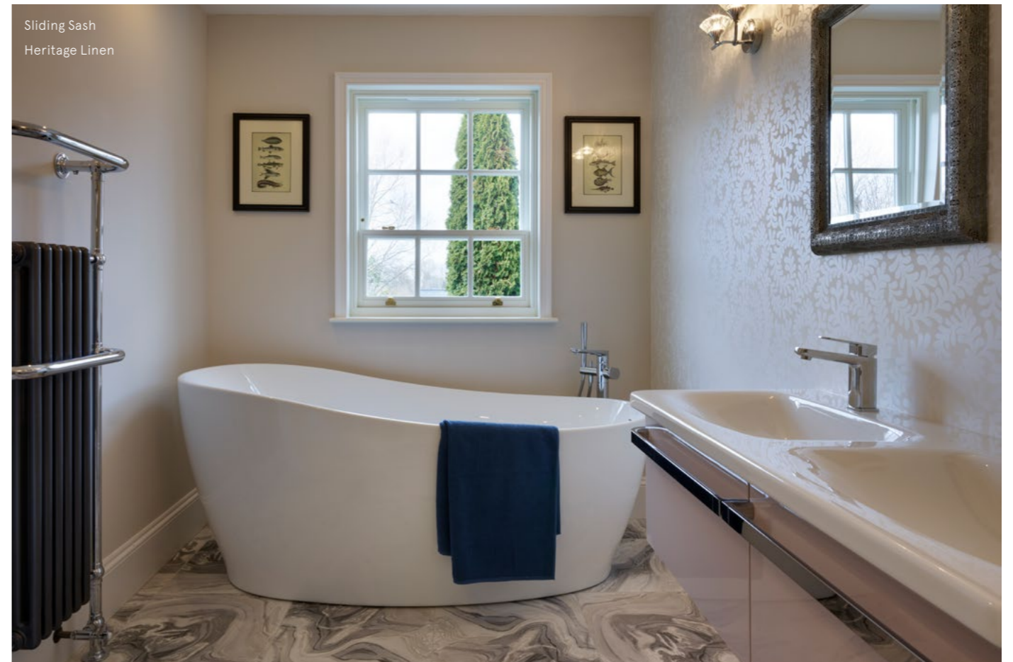
Sliding Sash Heritage Linen