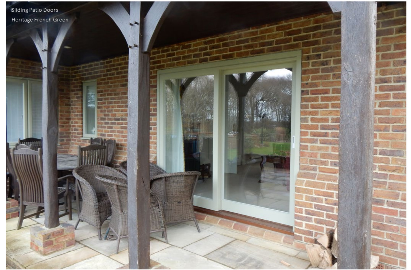
Sliding Patio Doors Heritage French Green