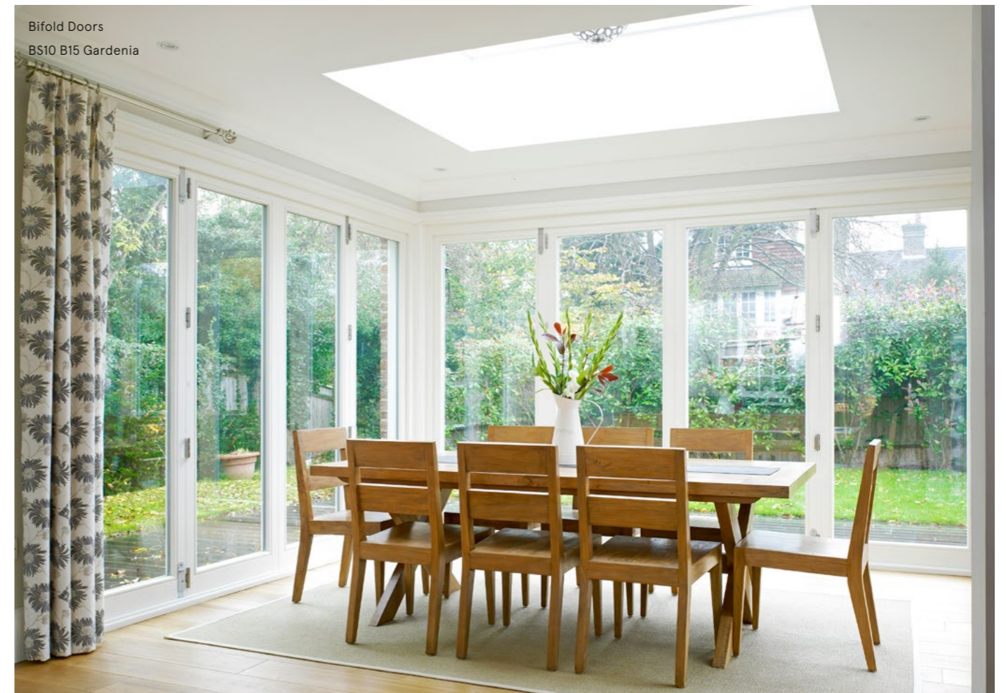
Bifold Doors BS10 B15 Gardenia